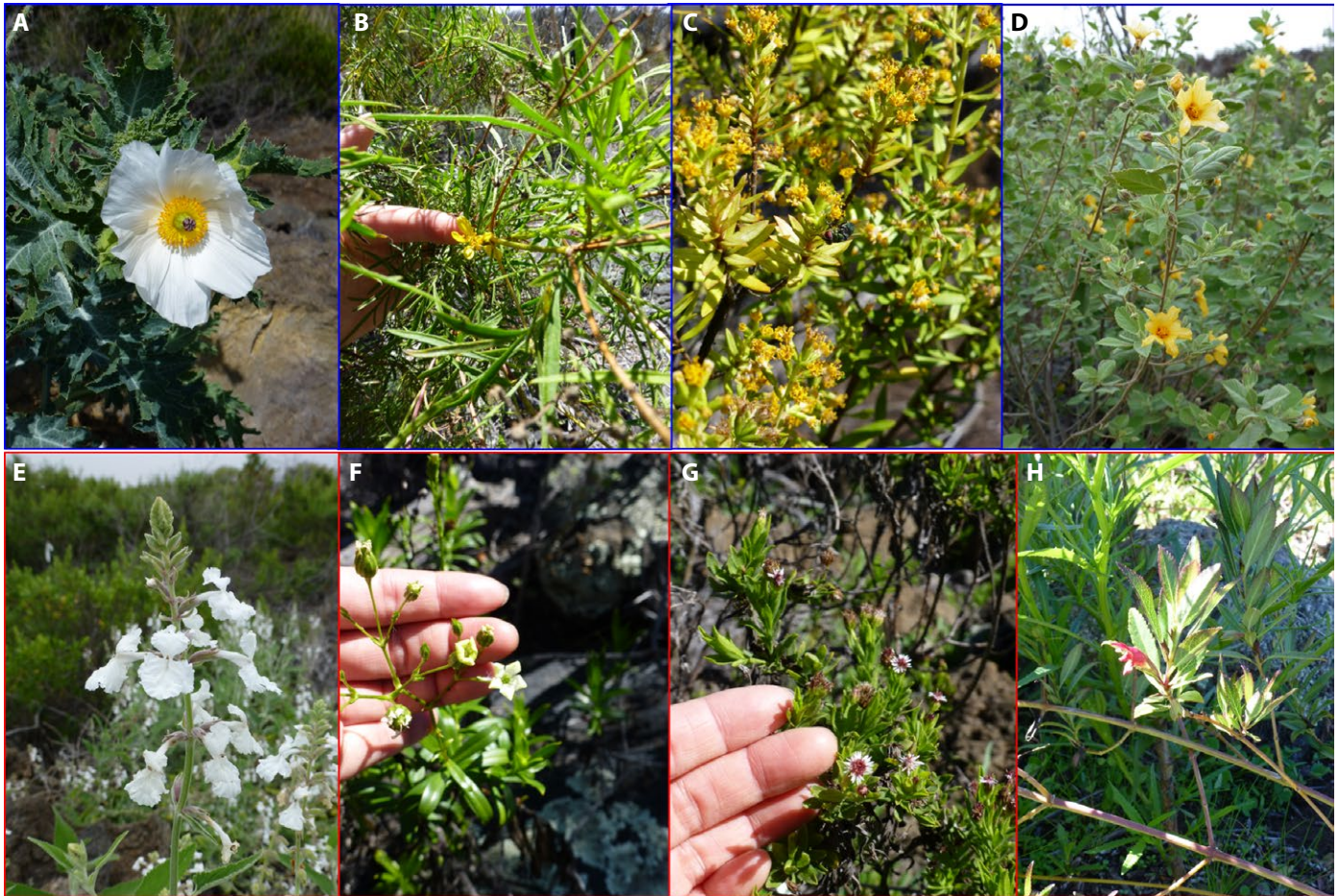
FIGURE 1. Flower characteristics of the focal plant species. Species A–D are common native plant species; species E–H are endangered plant species. (A) Argemone glauca (Papaveraceae): flower width 8.5 cm. (B) Bidens menziesii (Asteraceae): flower width 1.4 cm. (C) Dubautia linearis (Asteraceae): flower width 0.8 cm. (D) Sida fallax (Malvaceae): flower width 2.3 cm. (E) Haplostachys haplostachya (Lamiaceae): flower width 1.8 cm. (F) Silene lanceolata (Caryophyllaceae): flower width 1.0 cm. (G) Tetramolopium arenarium (Asteraceae): flower width 1.0 cm. (H) Stenogyne angustifolia (Lamiaceae): flower width 0.7 cm.

capitula; flowers of S. fallax are pale yellow, ~2 cm across, produced singly or up to seven per node, and occur year-round (Wagner et al., 1999). Flowers of H. haplostachya are aromatic, bilaterally symmetrical, short, white tubes (~1.5 cm across) with enlarged lower corolla lobes, produced in a raceme with two flowers at each verticillaster, and plants produce flowers repeatedly throughout the year except in drought conditions; flowers of S. lanceolata are solitary short off-white tubes (~1 cm across), produced in spring, summer, and fall; flowers of S. angustifolia are ~2 cm long, bilaterally symmetrical tubes, with a reduced lip, ranging in color from red-orange to maroon and produced in pairs throughout the year except during drought conditions; flowers of T. arenarium are very small composites (<1 cm across) with white or pink corollas, borne on upright stems in clusters of 5–11 capitula, and senesce in drought conditions (Wagner et al., 1999; Fig. 1).