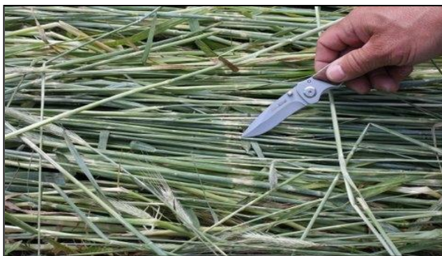
Figure 2. Rye cover crop that has been rolled and crimped.

In 2010, the University of Vermont Extension conducted the second year of an experiment to evaluate the impact of cover crop termination and reduced tillage strategies on soil health, soil nitrogen dynamics, and corn silage yield and quality. The goal is to document the positive and negative aspects of each strategy so farmers can decide the best way to terminate cover crops and implement reduced tillage on their farm.