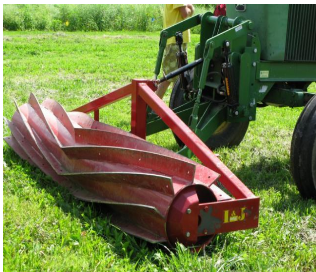
Figure 1. Roller crimper.

When a crop such as corn silage is harvested in the fall, the entire plant is removed, leaving the soil exposed through the winter. These exposed soils are more prone to run-off and erosion of sediment and nutrients into surface waters. As a means to alleviate these issues, many farmers have started to plant cover crops following harvest. Growing a cover crop can have many positive benefits to the soil and the