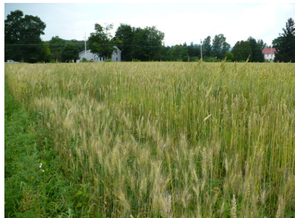
Image 4. Heirloom plots differing in height and awns.

The highest average yield was Surprise with 1611.8 lbs ac -1 while AC Norwell was the lowest yielding at 680.6 lbs ac -1 (Table 7). Weeds, especially Wild Mustard, severely impacted plots at this site. The weeds were so prolific that it was necessary to hand weed the trial area three times throughout the season. The most prevalent plant disease found at the North Troy site was Fusarium Head Blight (Image 5). Bird damage was not an issue at this location.