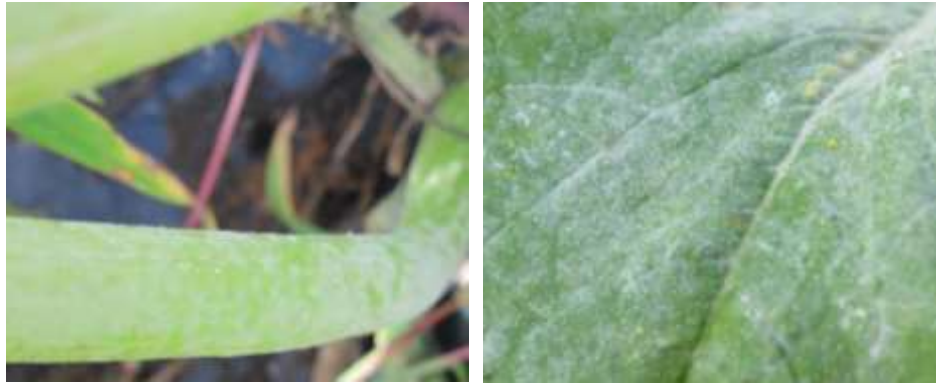
Image 1. Powdery mildew on squash stem (left) and leaf (right), Alburgh, Vermont, 2016.

Powdery mildew grows well in environments with high humidity and moderate temperatures and can be problematic on crops in the Northeast. Cucurbit crops face powdery mildew and often downy mildew on a yearly basis and significant yields losses have been reported. The family of cucurbits is an important part of the diversified crop mix of a typical commercial vegetable farm in Vermont and throughout the Northeast. Growers have been using cultural practices, fungicides, and multiple plantings to mitigate crop loss from powdery mildew, however, the impact of the disease is seasonally dependent and still represents a consistent loss.