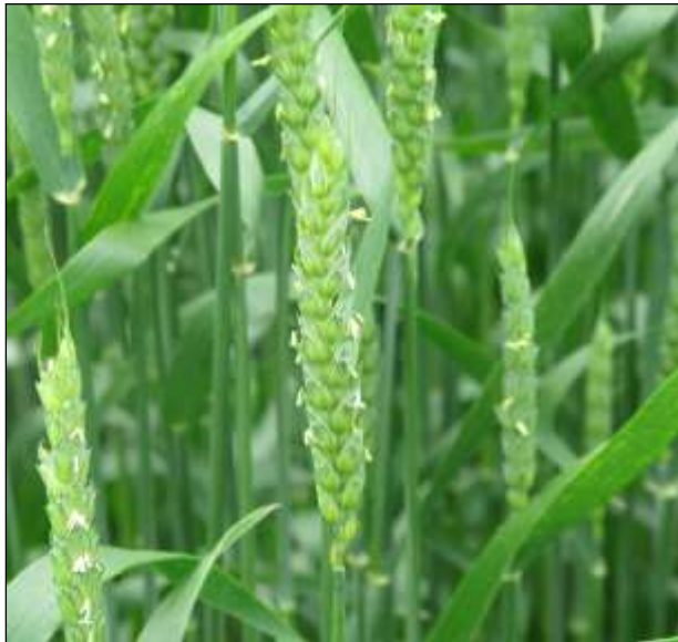
Image 1. 2014 Flowering winter wheat, Alburgh, VT

The flowering date was recorded when approximately 75% of the plot was in bloom for each of the varieties (Table 4). At this trial location most varieties were in full bloom by 14-Jun (Image 1). In general, bird damage and weed pressure were slight.