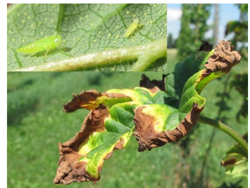
Image 2. Potato leafhopper damage (hopperburn) and nymphs (inset).

Potato leafhoppers (PLH) often have a better year immediately following a warm winter like we experienced in 2015/2016. PLH blow in to Vermont from their overwintering habitat in southern states. The warmer the winter, the further north PLH are able to stay for the winter, which means they will have a shorter journey to Vermont in the spring. This combination of circumstances set the scene for the greatest number of PLH seen in our hop yard since the outset of our seven-year project (see Figure 1). These huge numbers of PLH, an average of 6 PLH per hop leaf throughout the season, lead to extensive PLH damage, called “hopperburn” (Image 2). Hopperburn is caused by an interaction between PLH feeding and plant responses, resulting in reduced photosynthesis and ultimately leaf necrosis.