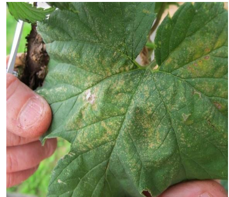
Image 1. Stippling caused by two-spotted spider mite damage.

Typically, predatory mites and the specialist spider mite destroyer maintain TSSM levels below economic thresholds. Particularly in years like 2016, an integrated pest management (IPM) program of weekly monitoring of the pest and beneficial populations is crucial for decision making. In hops, weekly scouting of the underside of three leaves per plant out of every 25-30 plants, and in each variety, is recommended. When TSSM populations began to explode in 2016, we were forced to take action in applying Trilogy (Certis USA), an OMRI approved fungicide/miticide/insecticide, at several points. For more information regarding approved pesticides for hops production, please see our website, www.uvm.edu/extension/cropsoil/hops .