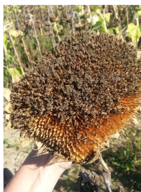
Image 1 and 2. Sclerotinia stalk rot and bird damage.