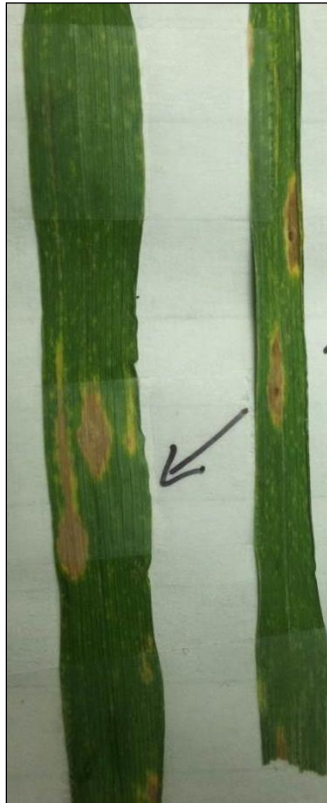
Image 2. Tan spot infected leaves ( Pyrenophora tritici-repentis ).

wheat and spring barley in Alburgh, VT, and on winter wheat in Bridport, VT. It was also found on the leaves of winter wheat in Shelburne, VT and Berlin, VT. Powdery mildew is relatively easy to identify, the fungus produces whitish-gray cottony growths on the upper leaf surface or stem of the infected plant (Image 1). Primarily infection occurs on the lower leaves and stem sections of the plant.