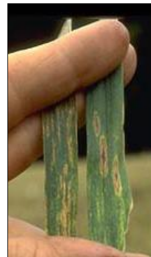
Image 3. Left leaf infected with Septoria tritici blotch (STB) ( Zymoseptoria tritici ) and the right with Stagonospora leaf blotch ( Stagonospora nodorum ).

Leaf rust ( Puccinia recondite ) was observed at only two sites, Alburgh, VT and Northfield, MA. Leaf rust is the most common of the rust pathogens. It is characterized by round rusty-red/orange masses of spores on the leaf surface (Image 4). Striped rust ( Puccinia striiformis ) was also identified on winter and spring wheat at the Alburgh, VT location (Image 5).