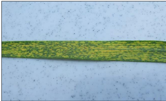
Image 6. Genetic resistance response in winter wheat.

were taken to the UVM Plant Diagnostic laboratory for identification. Interestingly, they found that this discoloration was not a disease but a genetic resistance response to foliar diseases.