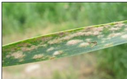
Image 1. Powdery mildew on spring wheat.

Foliar diseases reduce photosynthetic leaf area, use nutrients, and increase respiration and transpiration within the infected plant tissues. A diseased plant typically exhibits reduced vigor, growth and seed fill. The earlier the occurrence, the greater degree of infection, and the longer duration of conditions favorable for disease development the greater potential for yield loss. The following foliar diseases were identified during scouting visits.