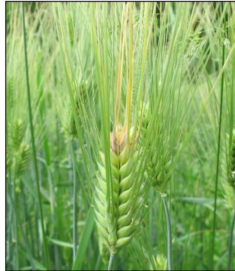
Image 8. Fusarium head blight ( Fusarium graminearum ) on spring barley, Alburgh, VT.

http://www.uvm.edu/extension/cropsoil/cereal-grain-testing-lab ). All on-farm locations were scouted at soft dough to assess FHB severity using the North Dakota State University visual scale. The cool and wet conditions during much of the growing season created the ideal conditions for Fusarium growth. Premature bleaching of heads and orange or pink kernels were observed on winter and spring wheat, and on spring barley at all locations (Image 8).