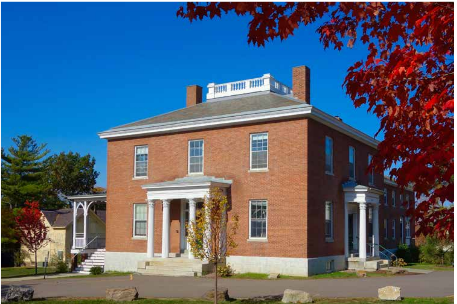
Wheeler House, home of the University of Vermont Department of History and Historic Preservation