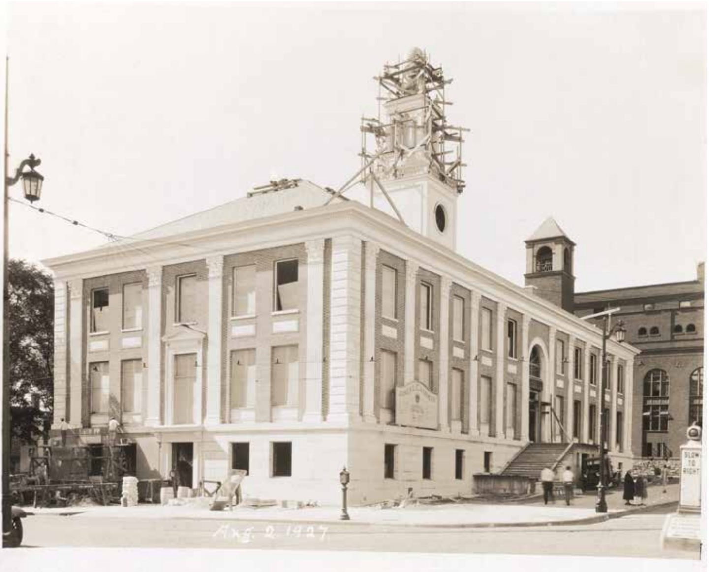
Burlington's colonial revival City Hall under construction in 1927