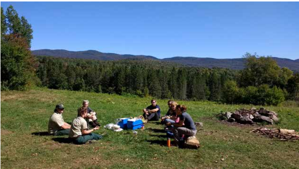
The second-year class enjoying lunch on a field trip to the Green Mountain National Forest

Historic Preservation Program Department of History • Wheeler House 133 South Prospect Street University of Vermont Burlington, Vermont 05405