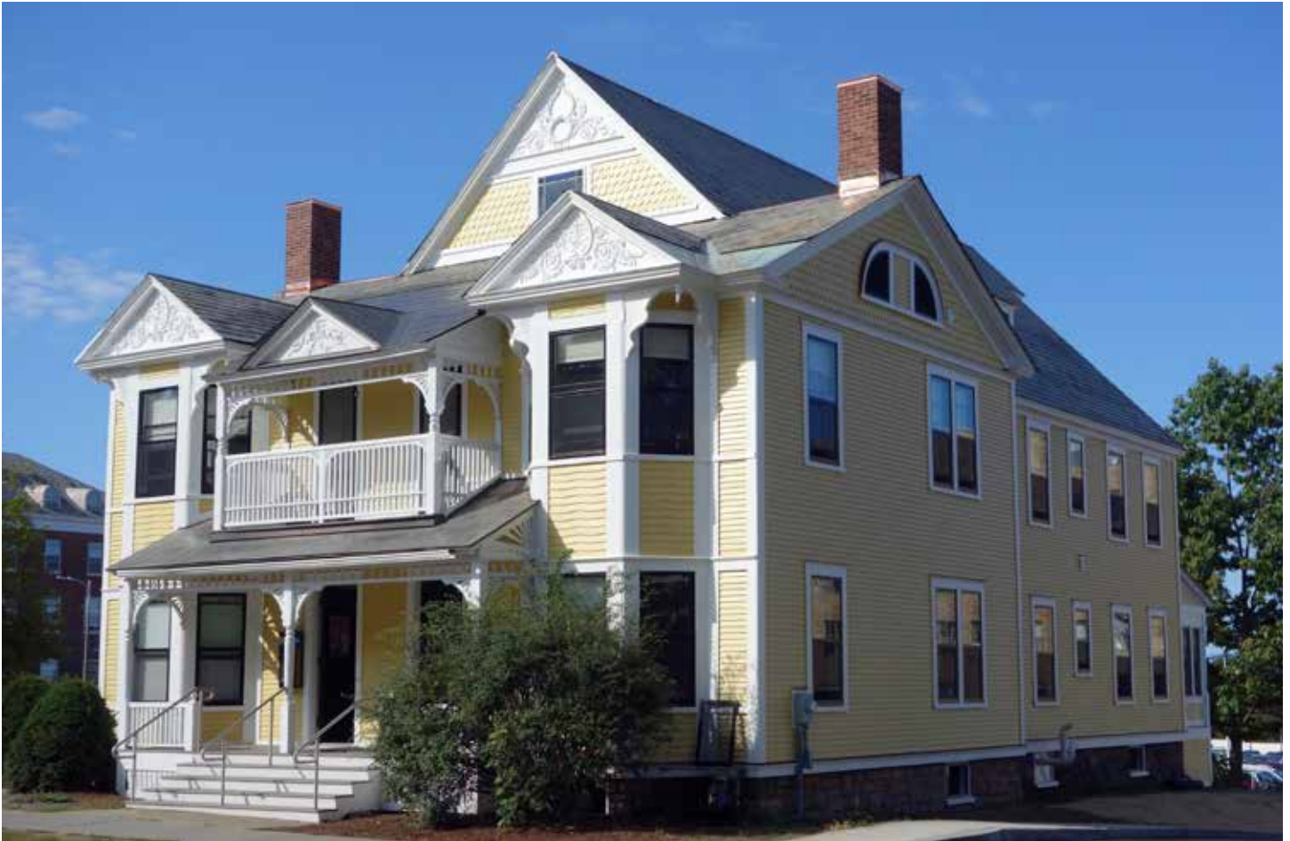
Nicholson House after restoration

Long covered with white aluminum siding, the exterior of the historic Nicholson House on the University of Vermont campus has been restored to its historic colors with research assistance by UVM historic preservation students and faculty. At the request of the UVM Physical Plant, students in Professor Visser's Architectural Conservation I course sampled accessible exterior surfaces as a class project. By examining numerous cross-sections of paint samples under digital and UV microscopes in the UVM Historic Preservation Lab, they determined that the base coat of paint on the clapboards was originally a yellowish ivory, trim and porch