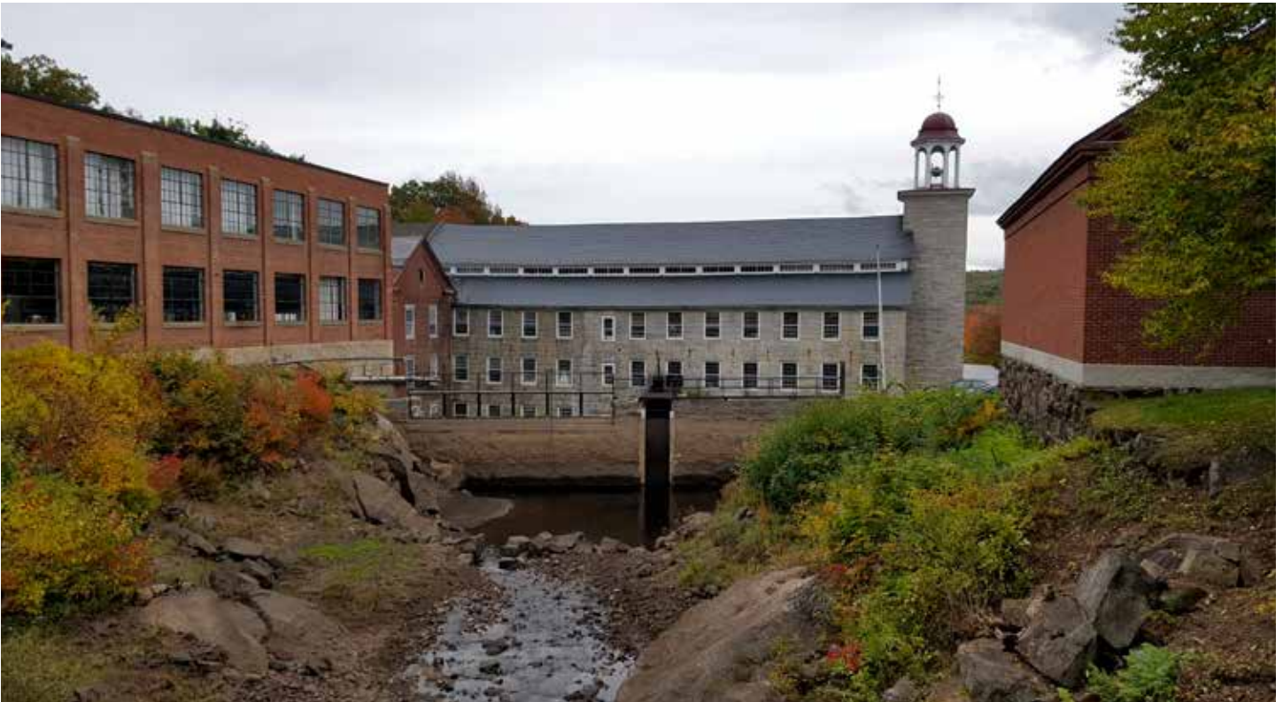
Cheshire Mills, the centerpiece of Historic Harrisville's industrial mill complex.