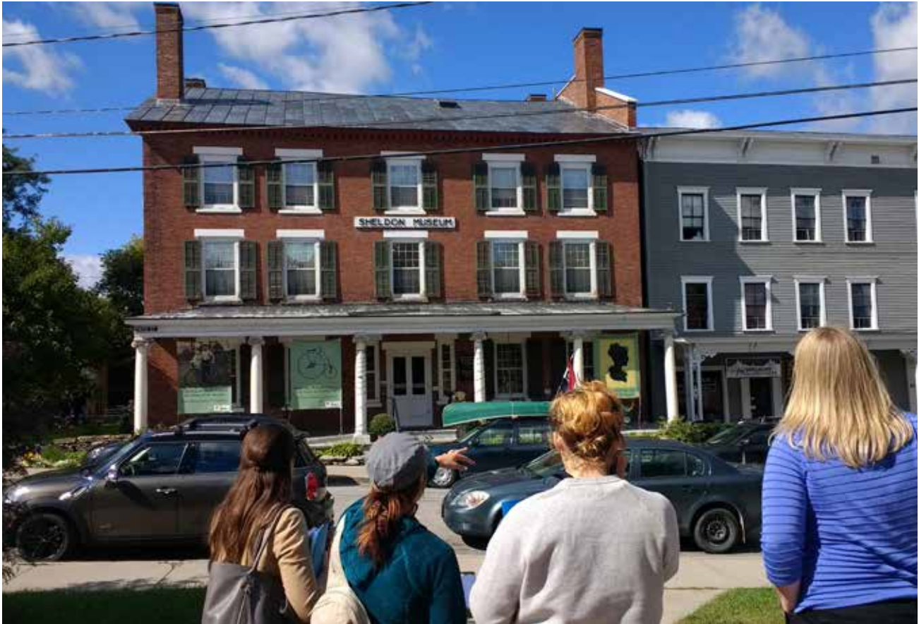
Attendees performing a brick assessment of the Henry Sheldon Museum in Middlebury, Vermont.