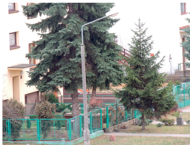
Figure 3. Ornamental plants in front gardens of detached houses in Toruń

The conditions of urban areas depend on the quality of the environment for the environment produces benefits called ecosystem services, inter alia: fresh air, potable water, healthy food and flood protection. Properly working ecosystems are crucial for the sustainable development of urban areas, because they have positive influence on human welfare and economic activity (Kronenberg, 2011). Revitalization of wastelands in urban areas and changing them into commonly accessible farms may represent an