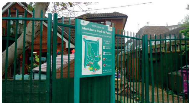
Figure 2. Entrance to the city farm in London

increase in the standard of living in cities. The availability of relatively cheap food has encouraged houses to display more ornamental plants, excluding space for food production. Agriculture in Poland has declined in this aspect. So what are the barriers and opportunities for the production of food in cities? First of all, in the era of universal education, the main focus is on the relationship with natural vegetation, occurring especially in national parks and nature reserves, while the interest in the agricultural landscape is much smaller. Similarly, garden plots have been converted into plots for recreation or for growing ornamental plants (Fig. 3). Perhaps it is time for a change, considering the same reasoning which is used in developed countries. Similarly, the production of food in cities makes it possible to use rural production for other crops, e.g. biomass. However agriculture in the cities undergo a risk of pollution involved in the urban environment. Current and past industrial activity, dense and dirty transport infrastructure, domestic burning of fossil fuels and the plethora of chemicals released into domestic waste streams all pollute the soil of cities (Meharg, 2016). In Poland, it has a special character because of the highly polluted air caused by car dependency and individual heat system in suburbs which is emphasized in the reports prepared by the European Environment Agency (2016).