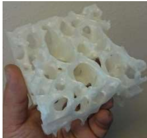
Fig 1. Example of application of the reverse engineering: a) bone, b) its digital visualization, c) its 3D-prints in various scales