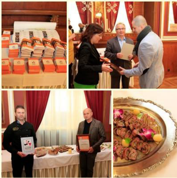
Fig. 13. The restaurants' owners awarded with the certificates and plaques of the 'Culinary Goose Trail'

Nowadays, the number of culinary tourists is increasing. According to Jędrysiak (2008), the culinary tourism constitutes a bigger and bigger part of the world tourism. Thanks to culinary heritage, tourists can meet different cultures and traditions of other countries and regions (Hall et al, 2003). The increasing number of culinary tourists was noticed by the local government. It also makes a great way for the promotion of the region. The Cuiavian-Pomeranian Province government has taken promotional actions for years. Moreover, the local authorities and the groups of the social representatives, like for instance village housewives clubs or local slow food producers producers are involved.