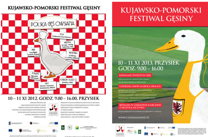
Fig. 6. The 'Goose Festival' in Przysiek promotional posters from 2012 and 2014.