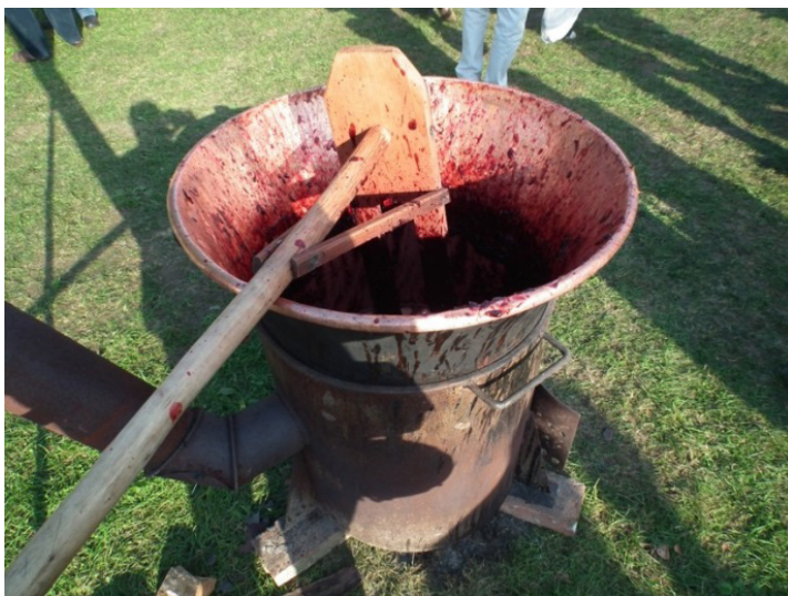
Fig.7.The traditional copper cauldron using for making plum preserve

Moreover, the plum preserve made in the Lower Vistula Valley is becoming more and more popular in the Cuiavian-Pomeranian Province. The area is inhabited by culturally different groups of people. The second part of the nineteenth century was a fruit farming development in the territory. At that time, settlers mainly from Netherlands, thanks to specific soil and climate conditions developed agriculture and orcharding. Nowadays, the traditional rituals are resumed.