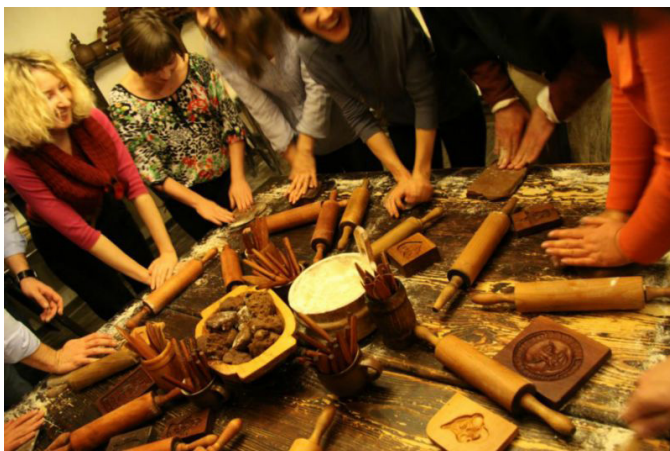
Fig. 9. A group of visitors preparing gingerbread cookies