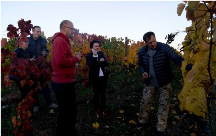
Fig.11. Owner of the “Przy talerzyku” vineyard with a group of tourists.

The wine from Cuyavia is another traditional product made in the region. According to many historical resources, the tradition of Polish vinification started in 11 th century. The vineyards were established mainly near monasteries, bishops’ or dukes’ residences, for instance, in Toruń (Charzański et al. 2013, Internet source no 6). Currently, it is hard to compare a development of enotourism in the Cuiavian-Pomeranian Province with the huge vine regions in the southern Europe. Viticulture and vinification is performed by a group of friends and hobbyists. Taking climate and the soils conditions into consideration, the Lower Vistula Valley is the most proper to cultivate grapevine. Moreover, in Koźielec “The Vine and Plum Festival” have taken place for some years (Internet source no 7). It draw the attention of the increasing number of enotourists. The meetings of vineyards and wine aficionados is taking place regularly in the vineyard called “Przy Talerzyku” (Fig.11).