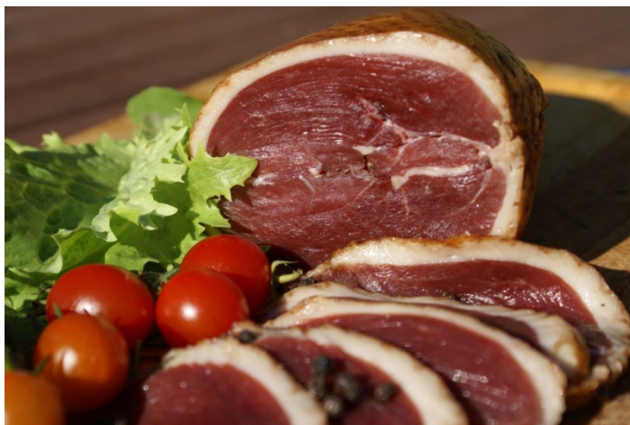
Fig.2. “Półgęsek” known also as “piersnik”.

The first, worth to mention, is “półgęsek”, which used to be a very popular snack in the Old Polish cuisine. It looked like a cylinder made of goose skin, with a layer of fat, sewed using twine or plaited string (Fig.2). Nowadays, it is raw smoked goose meat distinguished by intensive smell and taste. In the Pomeranian Province “półgęsek” is made from the goose breasts after removing the bones. Traditional ways of preparing goose meat in the Pomeranian, Kashubia and Krajna are known till now. The goose breeding is seasonal and lasts from the spring to the early winter. Traditional goose slaughter used to take place shortly before 11 th November (before Saint Martin’s Day). Preparing and curing, as well as smoking of “półgęsek” have become traditional ways of preservation.