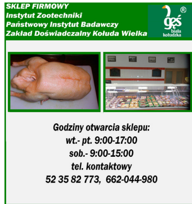
Fig.3. A trademark-shop selling goose products.

Taking the taste and nutrition into consideration, the Cuiavian-Pomeranian Province is famous for its best goose breed, so called the “Kołuda White” (gęś biała kołudzka). To continue and support traditional goose breeding The National Breeding and Research Center was founded in 2003, in Kołuda Wielka (village near Inowrocław). What is more, a brood farm and a hatch section exist there as well. Annually, pure-bred geese from the brood farm are delivered to local farmers. Nowadays, the “oat goose” is the most popular goose breed in Polish poultry. Moreover, it is also the most often exported and wanted product from Poland. The country exports about 95 % of goose meat. The National Breeding and Research Center also makes and sells goose goods or even dairy products made from sheep milk (eg. Bryndza cheese) (Fig.3).