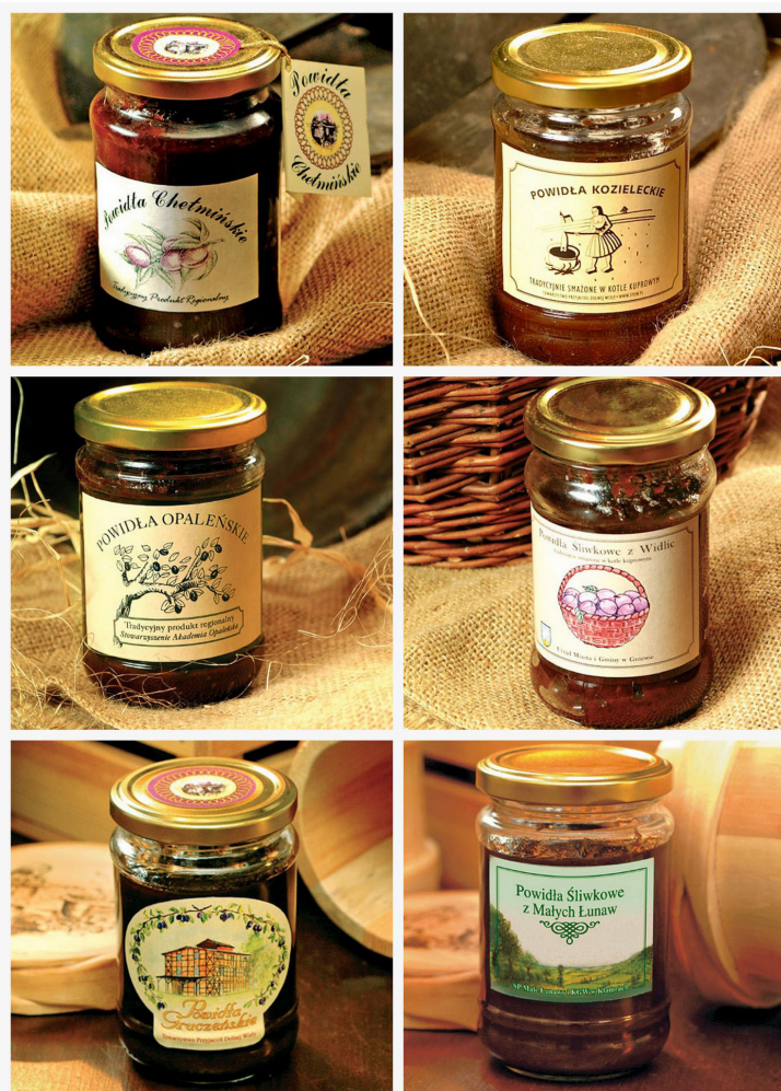
Fig.8. Plum preserves from the Lower Vistula Valley.