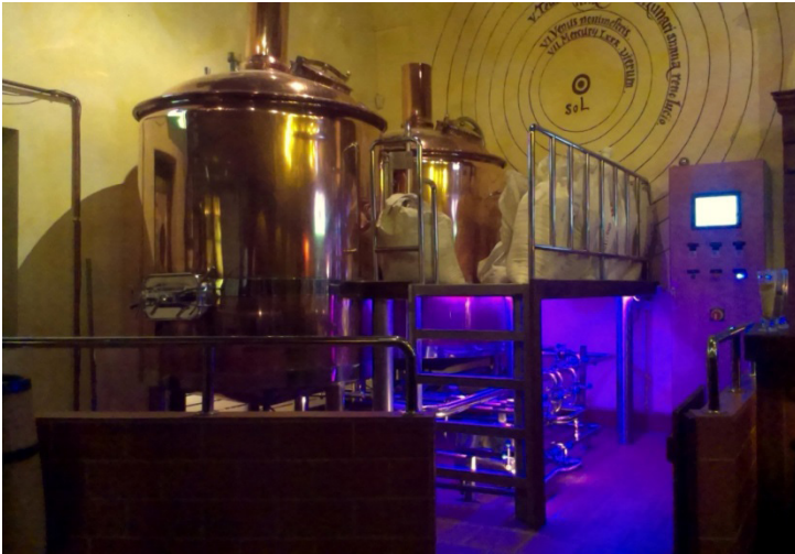
Fig. 12 The interior of the 'Jan Olbracht Brewery' located in the old town in Toruń.

Beer tourism is defined as a kind of tourism, of which the main goal is visiting breweries, taking part in theme festivals, tasting homemade beer (Hashimoto 2005). Unfortunately, the number of local breweries in the Cuiavian-Pomeranian Province is being drastically reduced. It has been caused by bigger brewing concerns. The traditional way of making beer is still held by local brewery called “Krajan” and two breweries which are placed in restaurants in Toruń and Bydgoszcz. Nowadays, “Nakielskie” pale and dark lager beer is made in the “Krajan Cuiavian-Pomeranian Brewery”. The tradition of making beer in Krajna province, especially in Nakło nad Notecią, was initiated at the beginning of 16th century. Beer tourism is also associated with visiting local microbrewery restaurants, which offer locally made beer. In the described province there are two restaurant breweries. “Jan Olbracht” Brewery in Toruń (Fig.12) is known of both - its homemade beer and traditional Polish and local dishes served.