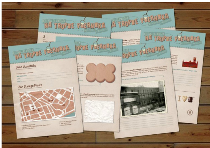
Fig. 10. Worksheets for gingerbread urban game 2014.