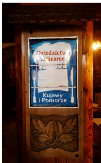
Fig. 10. Plaque informing that in restaurant are served local dishes from Cuyavian-Pomeranian region (Spichrz restaurant in Toruń).

One of the most popular and developing action taken is the promotion of goose dishes called “Goose meat on Saint Martin Day”. It gather the Cuiavian-Pomeranian Province Government, the National Poultry Association, some of the food processing and gastronomy representatives, and village housewives clubs. The effect of the last five-year activities is the 80% increase in goose meat consuming (Kamiński 2014). In addition, the Cuiavian-Pomeranian Tourist Organization set up the “Goose Culinary Trail” in September of 2013. It does many promotional activities. It printed maps and brochures, created mobile applications (Internet source 13). The “Goose Culinary Trail” is also promoted on the Internet as well as on the social networking services (Internet source no 14). Many culinary competitions are organized. The winners are able to win vouchers to restaurants which are placed on the trail (Fig. 13). What is more, many culinary festivals are celebrated.