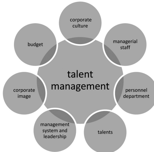
Figure 1. Internal conditions of effective talent management