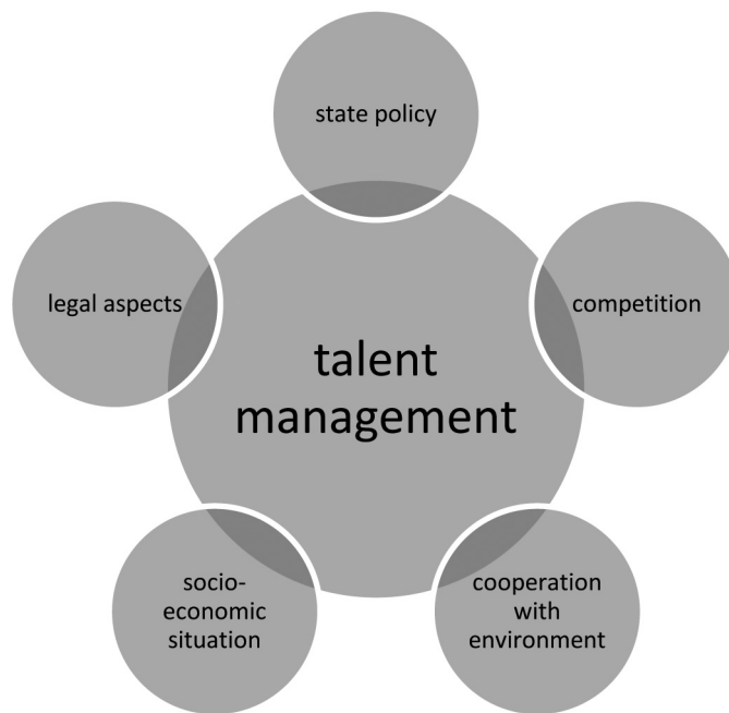
Figure 2. External conditions of effective talent management

Effective talent management is influenced not only by the conditions a company can have effect on. One cannot forget about external conditions, namely the ones which can be found outside an organisation. Factors of micro-environment can be mentioned here, i.e.: local community, competition, clients, as well as factors of macro-environment, i.e.: legal, economic, and cultural conditions. External conditions which influence effective talent management are presented in Figure 2.