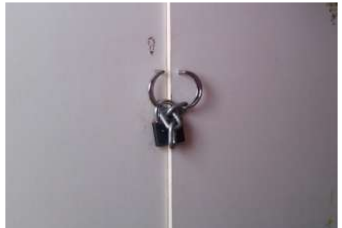
Photo 2: The Padlock with a Chain on the Doors to the Closet in the Little Living Room