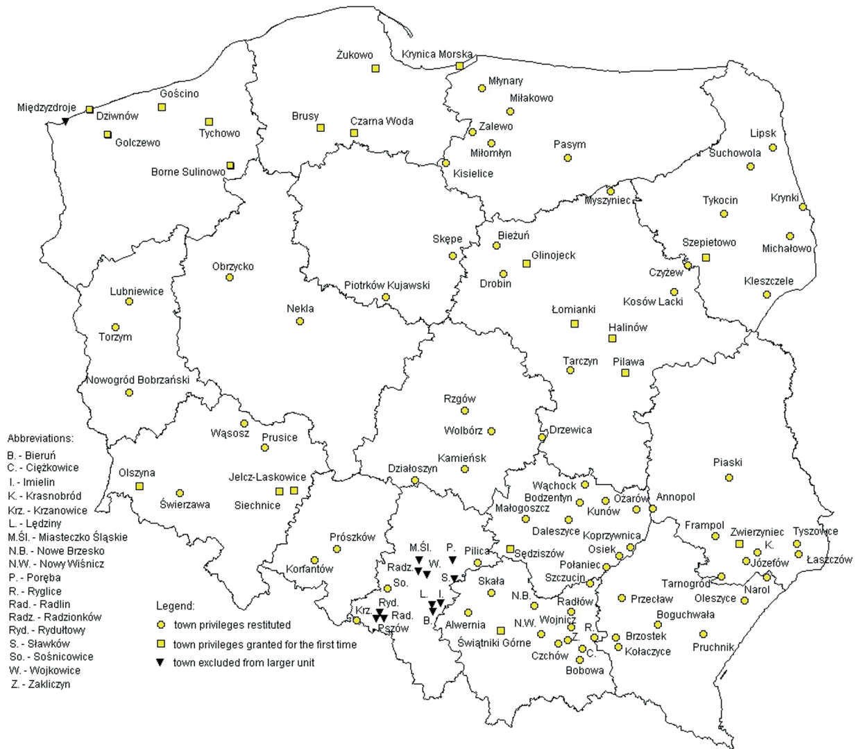
Fig. 1. New towns in Poland (created in 1978-2013) by their former status

The group R, most numerous, contains 74 towns; 12 more units (S) have been excluded from other towns (4), and the number of towns promoted to the rank of town (N) is 20 (Fig. 1).