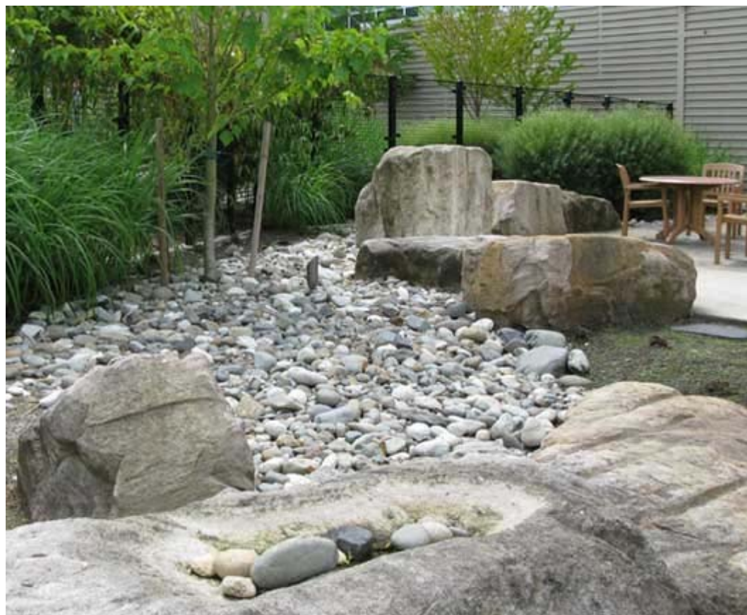
Ryc. 4. Ogród terapeutyczny przy szpitalu Overlake, Bellevue, Washington, USA Źródło: fotografia John Souza [27].

difficult to get lost, can also be called naturally-mapped environments [20]. These spaces are characterized by very few pathways visible from anywhere around the space with clear entrances and exits, and with well-considered accessibility expressed through the ground cover. Fig. 4 presents an example of distinction of the area that should not be accessed by covering it with stones.