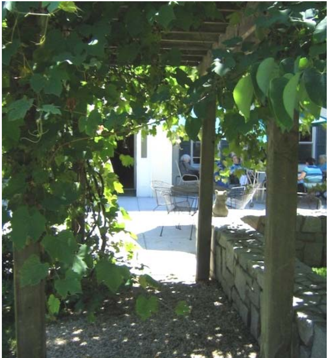
Ryc. 2. Ogród terapeutyczny przy ośrodek opieki nad osobami z chorobą Alzheimera Hearthstone, Marlborough, Massachusetts, Źródło: fotografia, Naomi Sachs [27]

Fig. 2. Therapeutic garden at theHearthstone Alzheimer's Care, Marlborough, MA. Photo by Naomi Sachs [27].