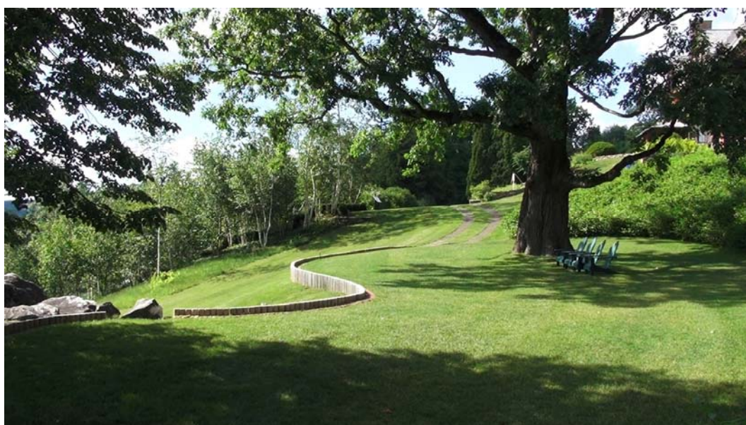
Ryc. 1. Widok na strefę wypoczynku, Naumkaeg Estate, Berkshires, Massachusetts / USA. Projekt Fletcher Steele, Źródło: fotografia A.A. Olszewska wykonana w czerwcu 2014 r.

Charm of natural scenery is an influence of the highest curative value; highest, if for no other reason, because it acts directly upon the highest functions of the system, and through them upon all below, tending, more than any single form of medication we can use, to establish sound minds in sound bodies [6].