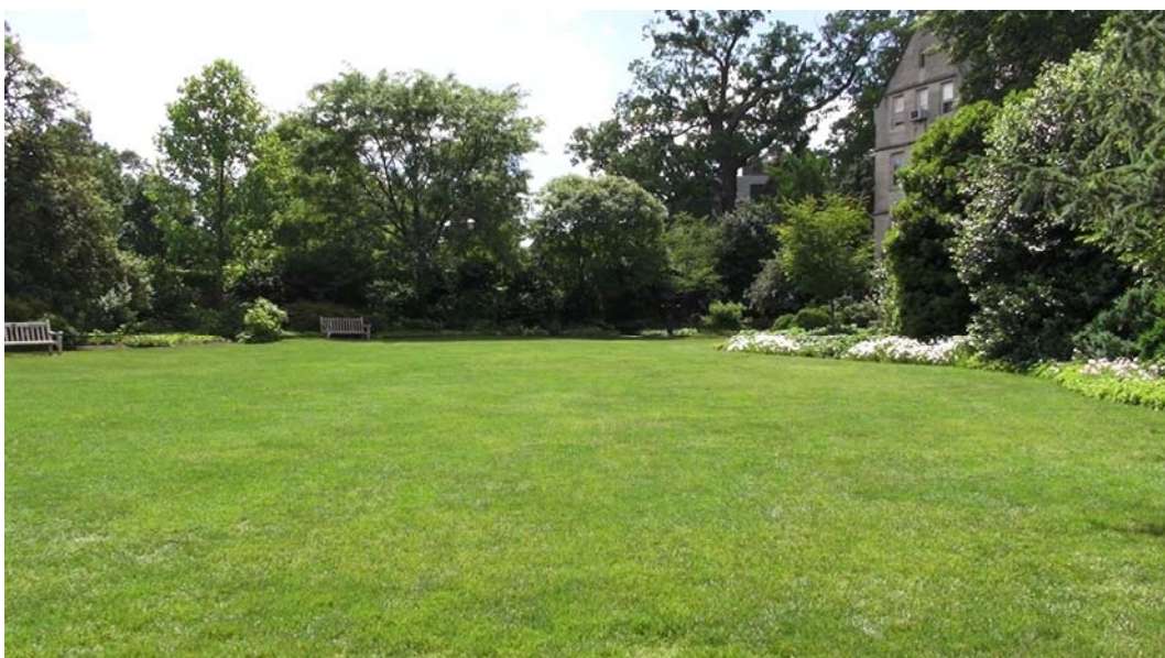
Ryc. 3. Trawnik otoczony nasadzeniami, Ogrody Biskupie przy katedrze w Waszyntonie, Washington D.C, USA

As to ensure the high level of compatibility in the enclosed space, inward composition is recommended, where all elements are organized around one clear center. The example presented in Fig. 3 shows the enclosed space with an inward composition, which also scored high in terms of compatibility in the Contemplative Landscapes Expert evaluation - 4,8 points in 1-6 Likert scale [21]. This inward composition of space can also be manifested through a clear signage system, which is very important for avoiding the feeling of being lost in space.