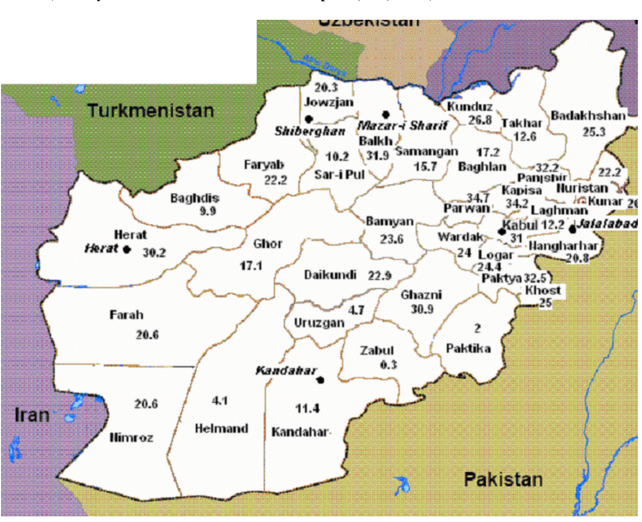
Map 2: Rural Literacy Rates in Afghanistan's provinces circa 2006

The emergence in the late 1960s and 1970s of a new generation of 'intellectuals' of rural origins and educated in state schools and universities was an explosive development, as they