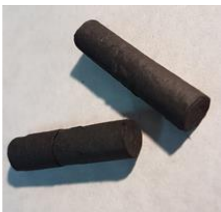
Figure 1. Image of the structured biomorphic sulfonated carbon based-catalyst

The acid site density was 1.52 \text{ mmol.g}^{-1} . Simultaneous esterification and transesterification of fatty acid (model FFAs and oleins=FFA+glyceric species) with methanol was used to verify the catalytic activities of the sulfonated carbon catalysts. The catalyst activity of sulfuric acid and MSA was also tested for comparison. Fig. 1 depicted the increase in yield percentage of biodiesel with increasing the time of reaction compared with homogeneous catalysts for short times as sulfuric acid and MSA catalyst. Homogeneous esterification were also performed to determine the reaction activity under similar conditions for compared with sulfonated carbon catalysts. The activity of homogeneous catalysts as \text{H}_2\text{SO}_4 and MSA was the greatest due to its inherent higher concentration of acid sites at short time of reaction with yields to biodiesel close to 97 and 99 %, respectively. The yields to FAME using sulfonated carbon as a catalysts are above 84.9% under the same conditions of homogeneous reaction.