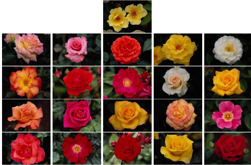
Fig. 3. An example of a query image from Flower class and retrieved images using our approach. The image from the first row represents the query and the remaining images represent the retrieved images.

that, the distance between a selected image and the query must be less than the defined threshold.