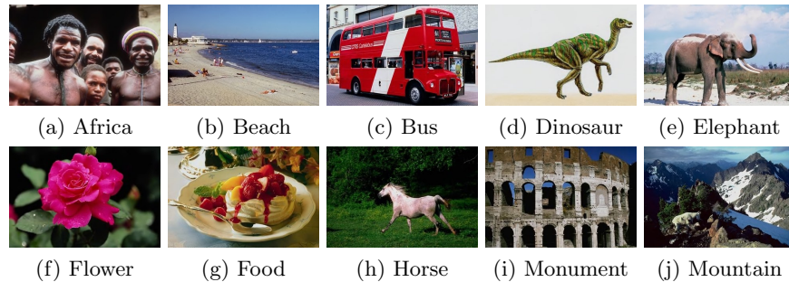
Fig. 1. Some samples representing the 10 semantic classes of Wang database.

later in image retrieval task: similarity between images is calculated based on the distance between class membership probabilities of query image and database images.