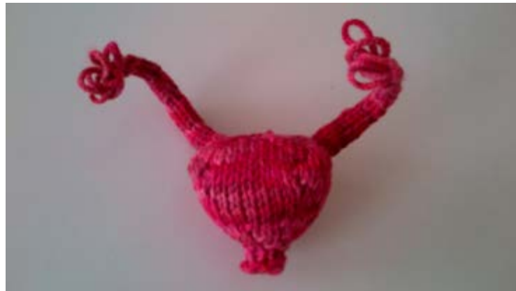
Figure 2: Uterus knit by the author and sent to a Member of Parliament in Canada. Pattern by M. K. Carroll.[83]

will you stay out of ours?"[78] This has been in response to significant efforts in the United States to dramatically reduce access to reproductive choice, which NARAL Pro-Choice America calls "The War on Women." [79] I myself decided to create a uterus (Figure 2) for a Member of Parliament who was trying to bring debate of access to abortion back into our House of Commons through a motion to re-examine the definition of "human being" in the Criminal Code of Canada,[80] and I created a video about it.[81] Other overtly political knitting projects have involved sending knit helmet liners to members of the United States Senate, or covering a military tank with pink knitting.[82] These activities are often seen as political in the public realm because they expressly address the supposedly proper realm of politics, namely state legislation and power. They do so, however, by inserting something that is generally excluded from the supposedly public political realm. This insertion gently mocks that delineation and works to undermine those who would have us believe that politics can and should be firmly separated from the domestic.