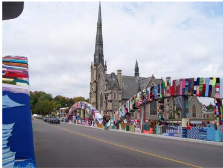
Figure 1: The 2010 KNIT CamBRIDGE installation in Cambridge, Ontario, Canada.

This distance from the functional can be seen in examples from various knitters, some of which are explicitly classified as art. Anna Hrachovec produces incredible, and often tiny, knit projects that do not have a functional purpose. One can view photos on her website [47] of art installation projects that encompass all kinds of knit creatures, including gnomes, snowmen, and mountains and rainbows with eyes. In another vein, KNIT CamBRIDGE was a project of Sue Sturdy, the 2010 Artist in Residence for the City of Cambridge in Ontario, Canada, and was a successful effort to cover the city's iconic Main Street Bridge with knitting. [48] Many knitters from many places, including myself, contributed knitting to the project (Figure 1). Thus, though much knitting is functional, not all knitting is functional, particularly today, and knitting is at times classified as art.