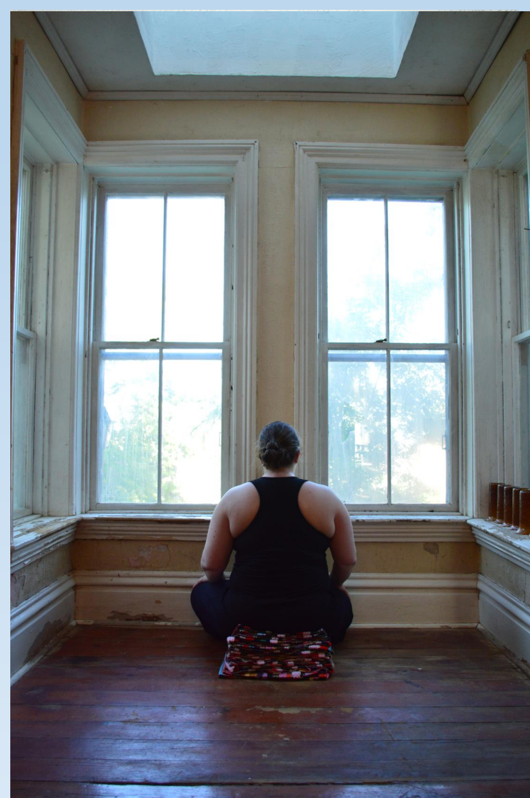
Meditation , digital photograph, 30" x 20", 2016