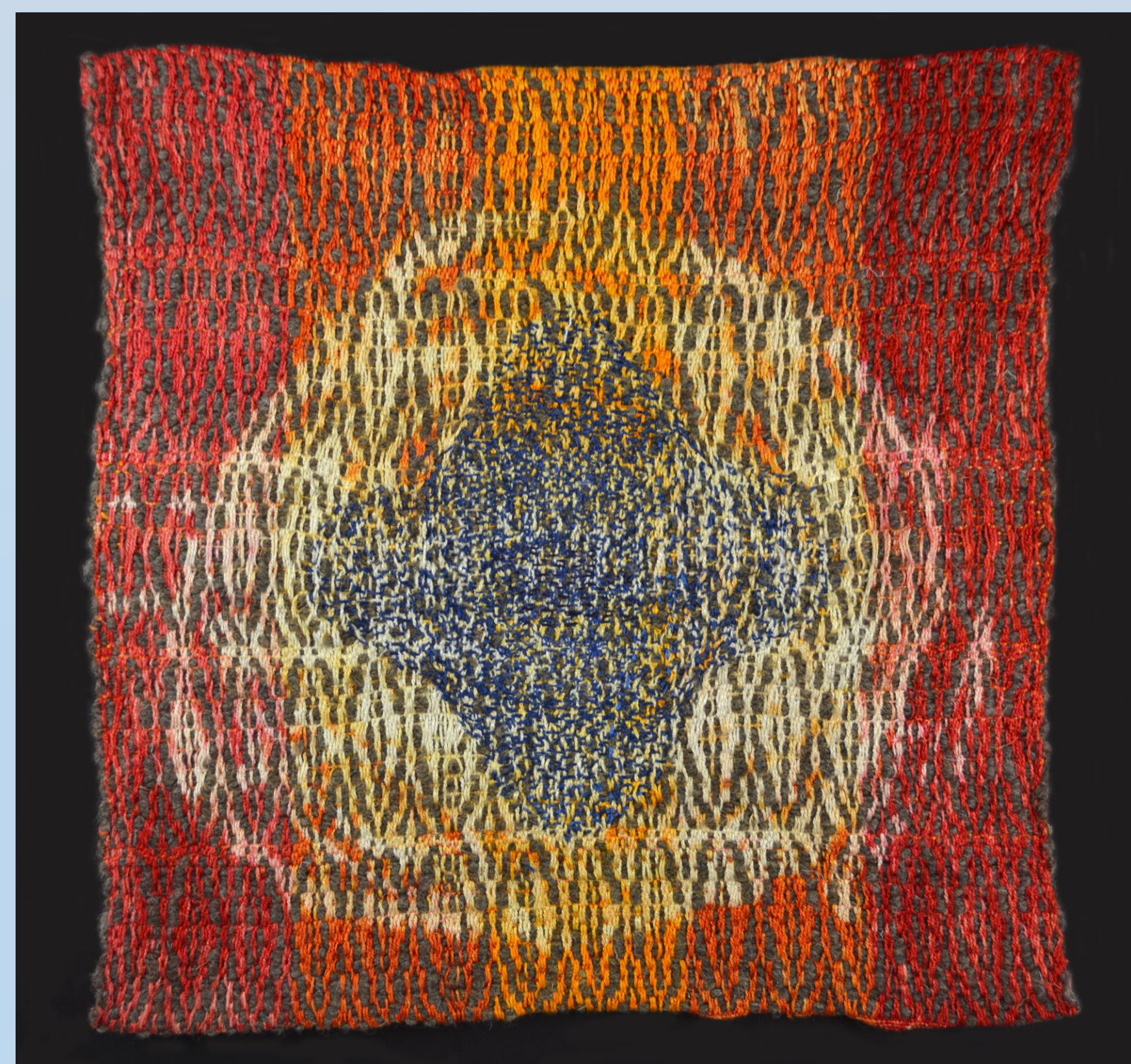
Circumference 4 , bamboo, alpaca, cotton, dye, bleach, 22" x 18", 2016