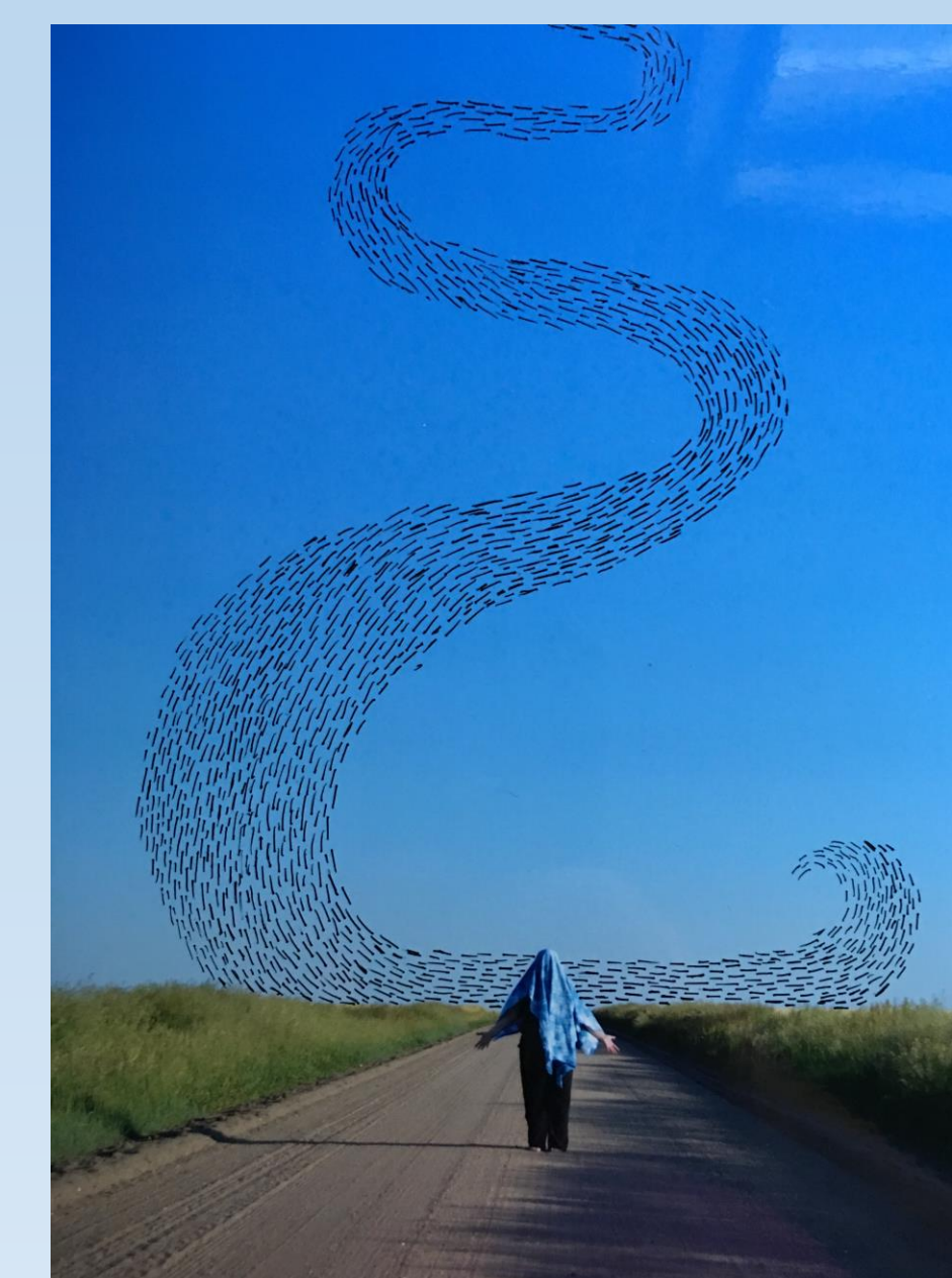
And the sky opens up... , ink on photo, indigo shibori dyed cotton, 10" x 8", 2017

Schools and community organizations were invited to participate in this weaving project. Over 700 participants have created cd weavings and are installed during the month of April 2017 at the Hays Public Library.