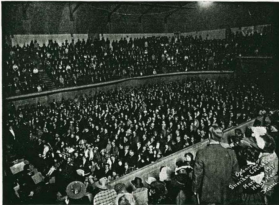
ENJOYING IL TROVATORE