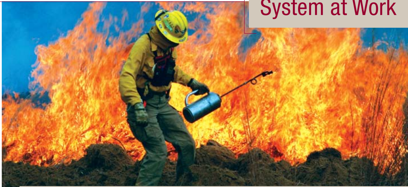
TAKING PRECAUTIONS When necessary, the Texas Forest Service uses prescribed burns as a way to reduce hazardous fuels, prepare sites for seeding and planting, improve wildlife habitats or temporarily control competing vegetation.

Airplanes buzzed overhead, dropping thousands of gallons of water and retardant, a slimy red mixture that deprives the fire of oxygen. The bulldozers from San Angelo arrived and joined the one from Fort Stockton to scrape up mounds of dirt and rocks to break the fire's