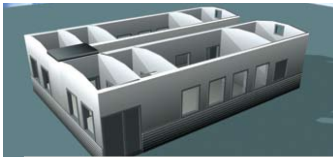
FLEXIBLE-BY-DESIGN The new National Center for Therapeutics Manufacturing will use models such as these to allow manufacturing of various quantities of drugs and vaccines to meet changing needs.

Management of the center initially will be provided by the Texas Engineering Experiment Station. An eventual partnership will be formed with a commercial pharmaceutical firm. Such collaborations mean that the production of therapeutic drugs that otherwise have been going to California, New Jersey and other locations will remain in-state.