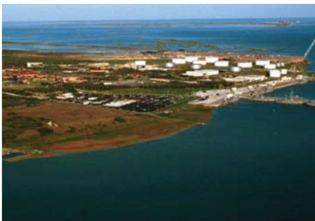
A VIEW FROM ABOVE The base for Naval Station Ingleside, scheduled to close in September 2010, will be redeveloped for renewable energy research by the A&M System under an agreement with the Port of Corpus Christi Authority.