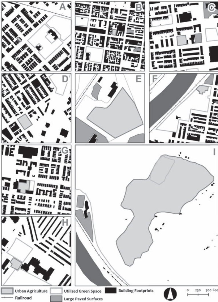
Figure 2. Examples of urban agriculture spatial typology in Philadelphia.

land-use categories included institutional and parks and open spaces.