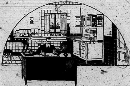
A comparative few cents a day puts a brand new, spick and span 1919 model McDougall in your kitchen!