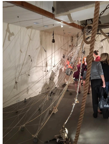
Fig. 2 Stories of Otherness , MFA Exhibition Fault Lines , Participant in "Trap," Mixed media 2016