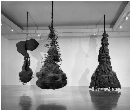
Fig. 8 Petah Coyne: Untitled Installation , Mixed Media, Brooklyn Museum, 1989