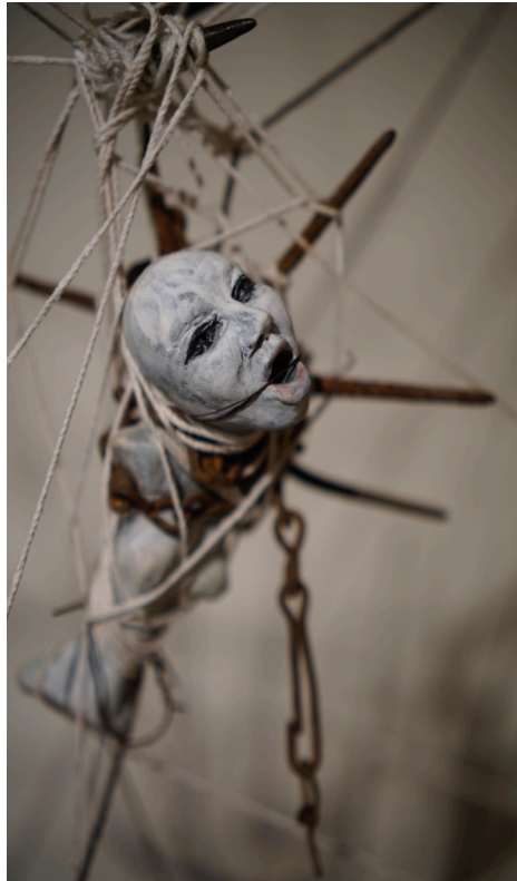
Fig. 3 Stories of Otherness , MFA Exhibition Fault Lines , Figurative Sculpture, Clay, 2016