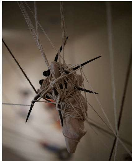
Fig. 4 Stories of Otherness , MFA Exhibition Fault Lines , Calf Weaner, 2016