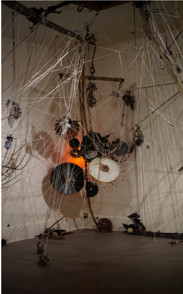
Fig. 1 Stories of Otherness , MFA Exhibition Fault Lines , Installation View, Mixed Media 2016