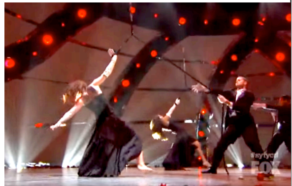
Fig. 9 Hanging On (Mia Michaels Choreography), Video So You Think You Can Dance , Season 9, 2012