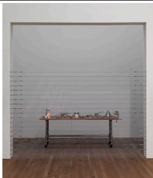
Fig. 12 Mona Hatoum, Home Wooden table, 15 steel kitchen utensils, electric wire, 3 light bulbs, software and audio Tate, 1999