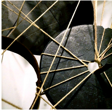
Fig. 5 Stories of Otherness , MFA Exhibition Fault Lines , Peephole Discs, Mixed Media, 2016