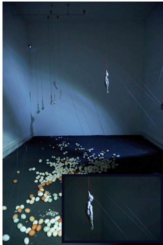
Fig. 7 Bindings IV Installation, Mixed Media, Winthrop University Student Gallery, 2014