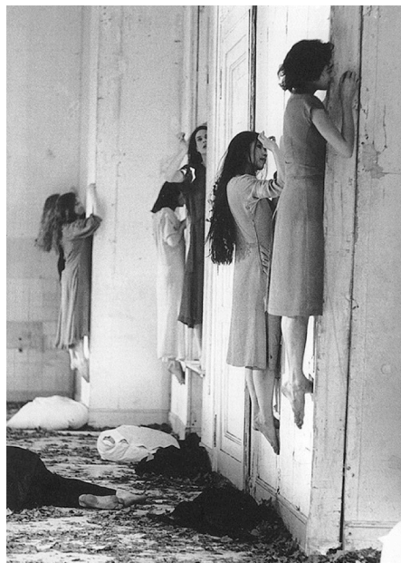
Fig. 10 Blaubart (Bluebeard) Choreographed by Pina Bausch, 1977