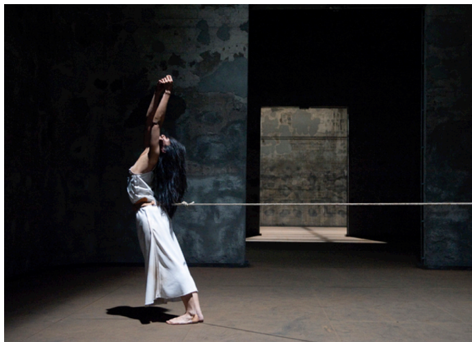
Fig. 11 Wim Wender's film, Pina , Choreographed by Pina Bausch, 2011