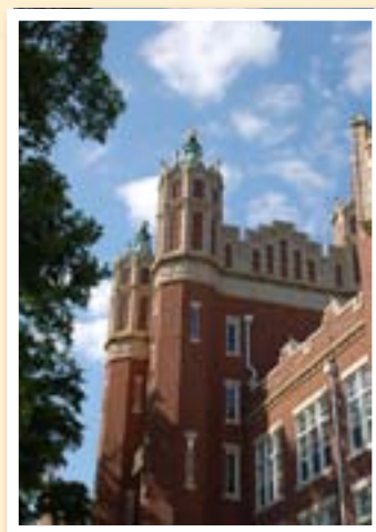
The Withers/W.T.S. Building celebrated its 100th anniversary.