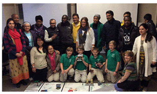
Members of the Sunset Park Center for Accelerated Studies robotics team along with Winthrop University TEA Fellows