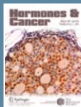
Hormones & Cancer

Translational Research on the Effect of Hormone Action on Cancer