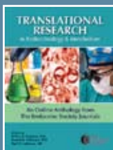
Translational Research in Endocrinology & Metabolism