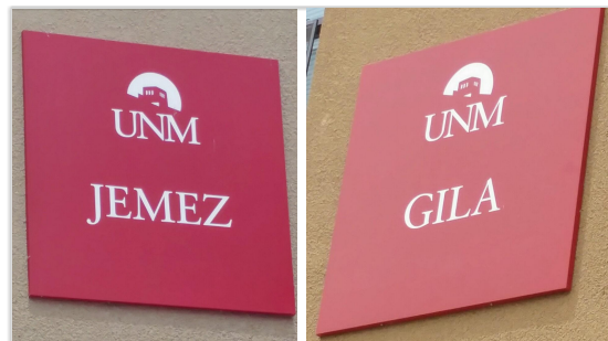
Figure 2. Photos demonstrating appropriation of tribal names to name student housing, as recently as 2014.