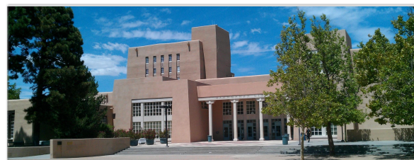
Figure 5. Zimmerman Library. This building is built in the pueblo style and is one of the centerpieces on campus where many students go to study and spend time with each other when not in classes.

As you can see, Zimmerman library has a large presence at our campus. Not only does the beautiful pueblo-style architecture reflect the New Mexico sun with glory (see Figure 5), it currently houses over three million volumes in its collection (University of New Mexico Libraries, 2015) and offers spaces for you to engage in your learning. There are large desks for you to spread out your academic work and small study carrels to reserve when you need concentration time. Upon enter the Zimmerman library, you will notice the distinct Southwestern-style furniture and the culturally rich art on the walls (see Figure 6). Many of our students find Zimmerman a great place to gather for group projects or to write your next essay.