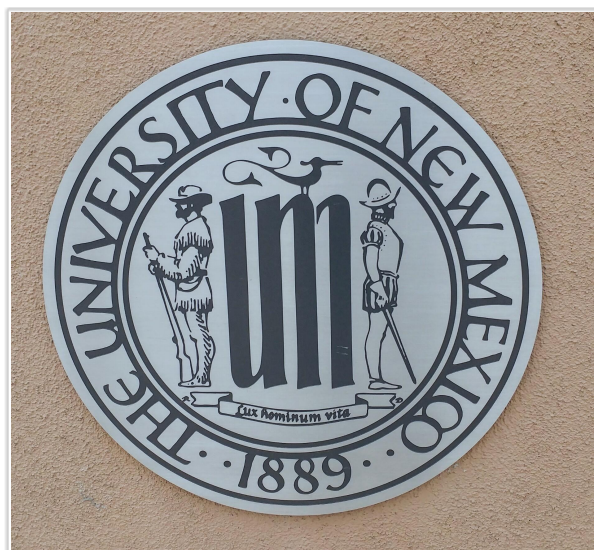
Figure 7. The UNM presidential seal has been criticized for representing the conquistador (on the right) and frontiersman (on the left), images often associated with settler colonialism.