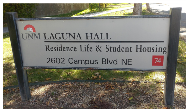
Figure 3. Student housing that paradoxically joins a conquistador name with a local Pueblo tribe that was directly affected by colonization.