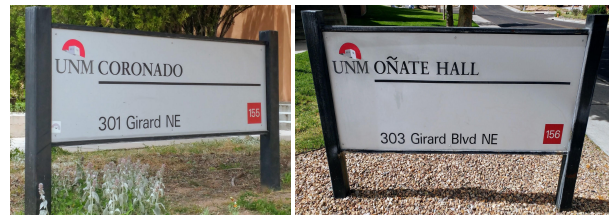
Figure 4. Student housing signs named after conquistadors, Francisco Vázquez de Coronado and Juan de Oñate. Each sits directly outside two of the residential housing buildings off the side of the road for cars and bicyclists in the city to see.

cast over it and what should become clearer is that colonization still occurs today and that institutions of higher education are participating in those actions. Unfortunately, as the campus tour continues, mounting evidence reveals that oppressive practices can also be found in the academic life of college.