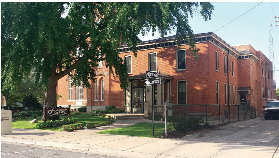
Fig. 7: The Dorsch Memorial Library in Monroe, Michigan.

He was a man of wide and varied intellectual interests, read books omnivorously in half a dozen languages, and exhibited, in writing his native tongue, a marked literary talent. In 1874 he published a volume of poems, some of which give evidence of poetic gifts of a really high order (Michigan 232).