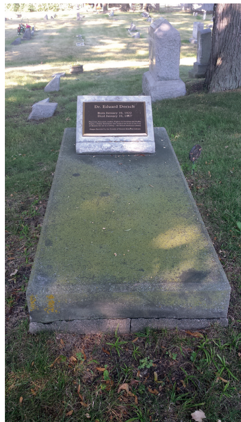
Fig. 6: Dorsch's grave in the Woodland Cemetery in Monroe, Michigan.