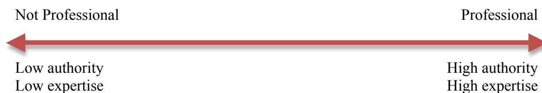
Figure 1. Teacher professionalization continuum

According to this model, as teachers gain expertise, they are given the freedom and authority to make decisions over classroom and school practices. The problem with this continuum is that it