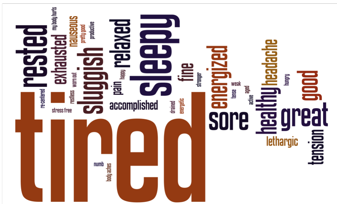
Figure 3. Physically

In this study, we found that the definition of social justice fatigue, the physical, mental, and/or emotional toll incurred through advocating for social change while serving as an agent of an institution of higher education , resonated with all participants. Each component manifested at some point during the 30 days together. The following images capture the nature of each dimension: