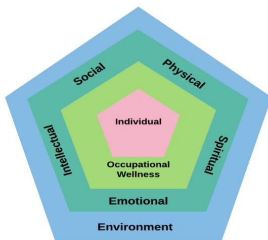
Figure 2. My Conceptual Framework

My conceptual framework centers the occupational dimension within a larger environment and proposes that the other elements of the wellness model serve as mediators of fatigue. This interdependent model allows us to understand occupational wellness as a component of holistic wellness. I centered the occupational dimension because I defined social justice fatigue within the context of individuals' work. Therefore, if one cannot change the nature of the relationship of one's work to the environment then focusing on the other dimensions of wellness can positively influence how individuals feel about their work.