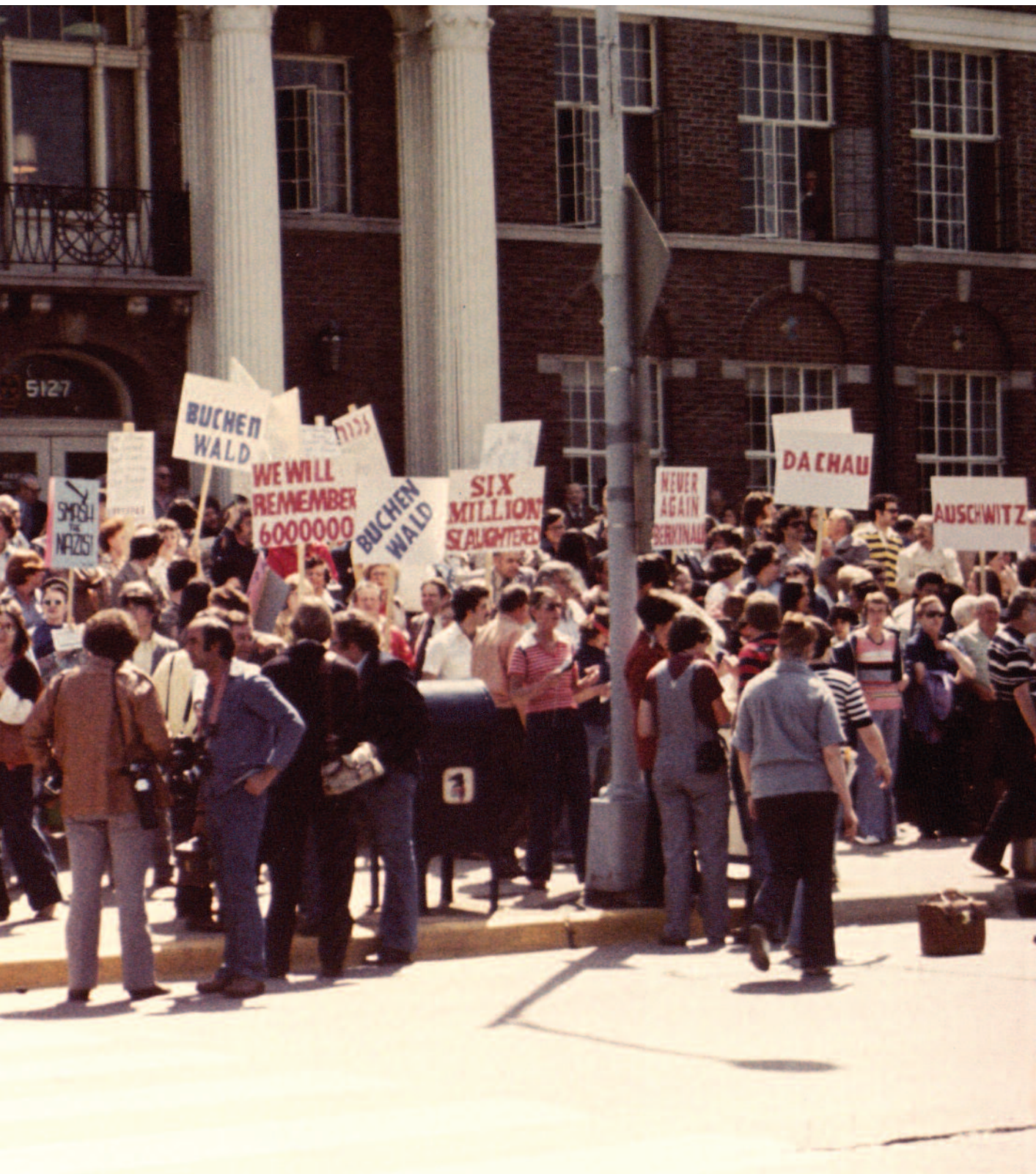
Demonstrators gather outside the Skokie Village Hall in 1977 in protest of the National Socialist (Nazi) Party's petition to march in their community.