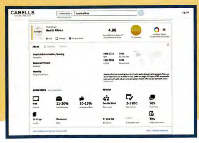
Figure 1: Cabells publishes its ranking scorecards and directory information on "journal card" entries.