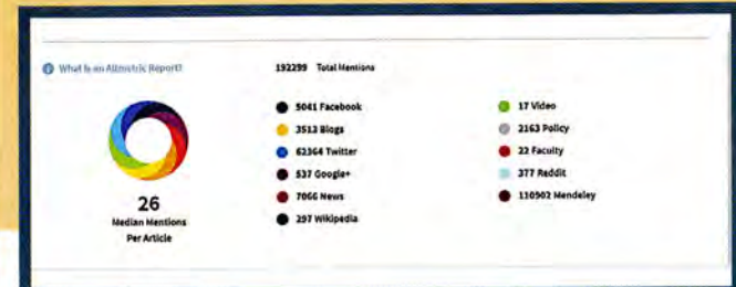
Figure 2: Cabells has averaged Altmetric reported article mentions to the journal level.