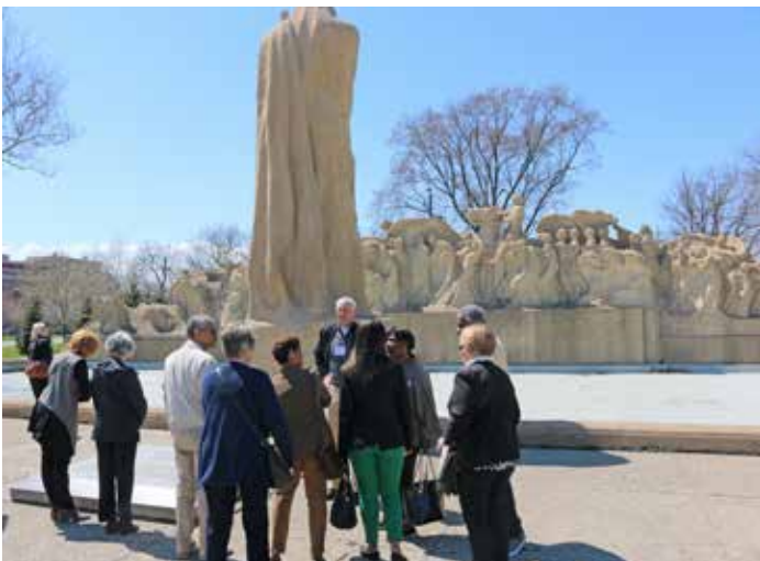
We took advantage of the gorgeous weather to stop and explore Lorado Taft's early 20th Century masterpiece The Fountain of Time .