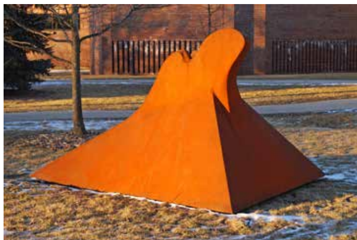
Outgrown Pyramid II