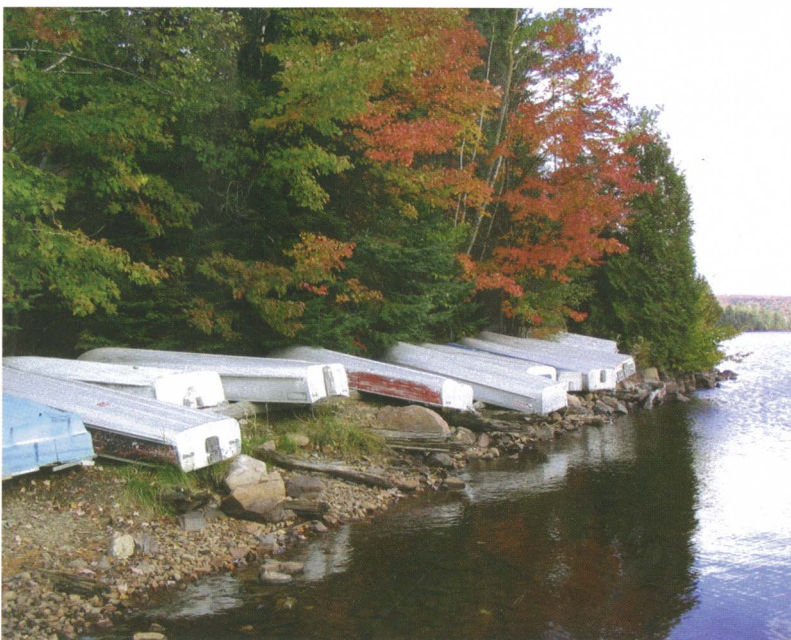
A scenic shot at a lake in Algonquin Park in Ontario, which was established in 1893 and is one of Canada's largest parks. It is a major center for biological and environmental research.

All Canadians are entitled to receive, without charge, necessary medical services provided by hospitals and physicians. Medicare actually consists of 10 provincial health insurance programs that are regulated by federal legislation. While the provincial programs are the sole insurers for most medical services, hospitals and physician practices are typically privately owned. Thus the system is best described as "publicly funded, privately delivered."