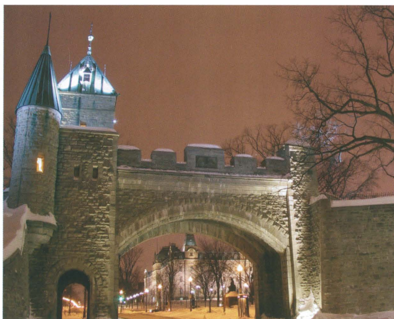
Porte St. Louis (Gate to Quebec) is part of the city's fortification system. Many structures from the 17th and 18th centuries have been preserved and are still in use in Quebec.