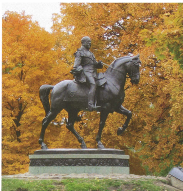
This monument to Edward VII is located in Queen's Park, Toronto. Canada remains a staunch member of the British Commonwealth.

The SARS scare had passed before I arrived in Toronto, but I observed much of the aftermath of the outbreak. Both the national and provincial governments have been carefully re-evaluating the organization of public health resources and leadership. During the crisis, there was no designated person