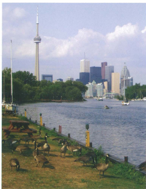
The CN Tower dominates the skyline of Toronto. At 1,815 feet, it is the world's tallest freestanding structure.

Because of the current world tensions, I had ample opportunities to discuss my perspectives of America with others. Many times people would argue that the United States should or shouldn't act in a certain way, and yet their arguments were based on the assumption that our cultural values should be identical to those of other Western nations. I would respond