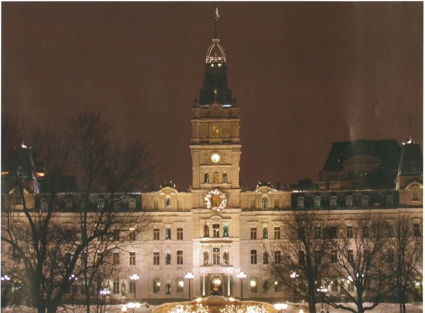
Opposite: The flags of Canada (left) and Quebec add to a colorful glass display. This page: The National Assembly of Quebec sits in this building, constructed in the late 19th century. The Assembly governs only provincial affairs; the name reflects Quebec's efforts to be treated as a distinct entity within Canada.