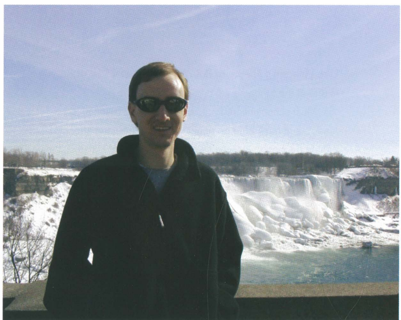
When not studying health policy and economics, the author took full advantage of opportunities to enjoy the country’s many sounds and sights — including this view of Niagara Falls.