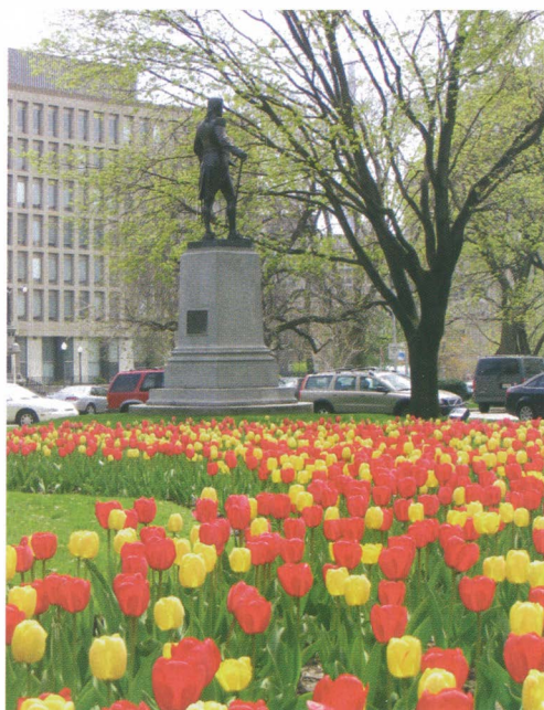
A statue of Gen. John Graves Simcoe, Upper Canada’s first lieutenant governor, stands amidst springtime splendor.

The chance to live in one of the most multinational cities in the world was tremendously valuable. My studies in health policy gave me the opportunity to compare the American and Canadian systems and to evaluate firsthand the strengths and weaknesses of universal healthcare. As I begin medical school at the University of Virginia, I hope to continue to expand my knowledge of our neighbor to the north, and to learn much that will help me contribute not only to the medical profession, but to American social policy as well. ●