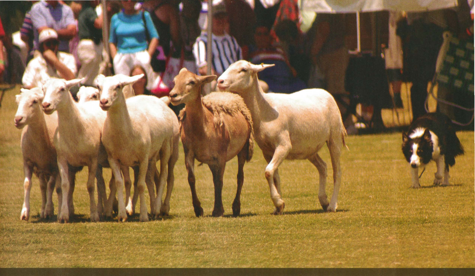
Clockwise from opposite top: The march of the clans featured a wide variety of appropriately bedecked representatives; a Border Collie made final calculations in preparation for its moment in the sheep-herding demonstration; athletes competed in seven contests, ranging from throws of 28- and 56-pound weights to a caber toss, in which competitors flipped a large log end-over-end; pipe bands used the occasion to show their precise steps and formations.