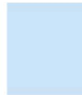
Figure 3. Example poster from a Visually Enhanced Sustainability Conversation.

Because the vision was oriented around pre-selected sustainability objectives, researchers conducted the criteria-based sustainability appraisal during the design of VESG. As described in Section 4.2, sustainability scientists vetted potential vision elements prior to the visioning workshops (based on objectives that aligned criteria identified by stakeholders and expert-based sustainability criteria), ensuring that the public discussions revolved around sustainability-oriented outcomes. A cursory sustainability appraisal of the vision reinforced that the vision does indeed describe a sustainable Midtown [34].