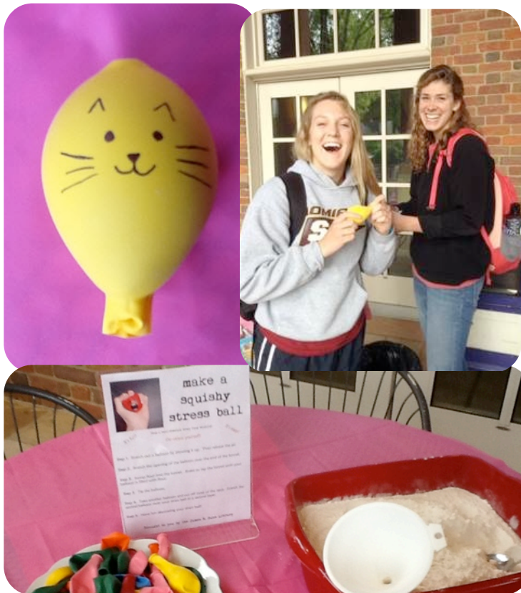
The Furman Libraries helped students de-stress during exams and midterms by providing supplies for making squishy stress balls.

On Monday, September 9, 2013, the Sanders Science Library celebrated five years of service to the Furman community. The open-house style party included a number of treats and activities including Make Your Own Slime, Test Tube Nerds, Sugar Molecule & DNA building, and a photo contest for the Sanders Science Library Facebook page.