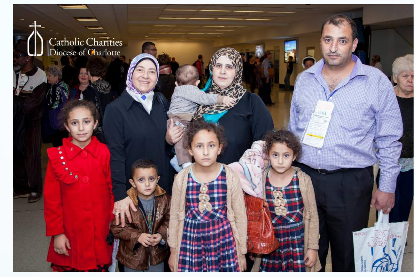
Catholic Charities' first Syrian family at the Charlotte airport reception area

"We are a Christian ministry of charity, service and justice dedicated to providing help to those in need, hope to those in despair, and inspiration for others to follow."