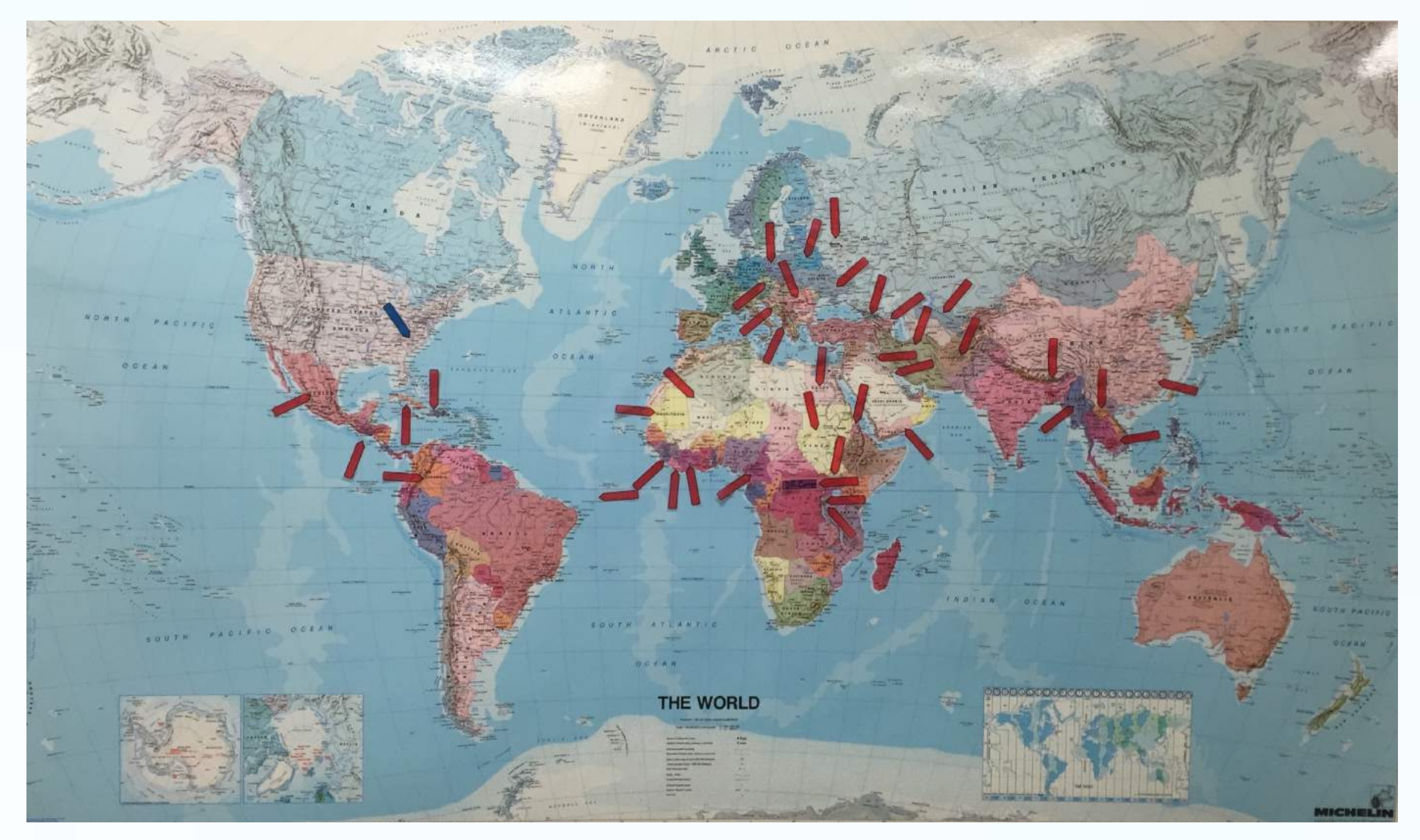
Map showing range of clients' home countries

Our refugee clients were from all over the world, including Syria, Congo, Somalia, Burma, Bhutan, and Ukraine We dealt with cases that were either sponsored or free cases, and the cases could be single or family cases.