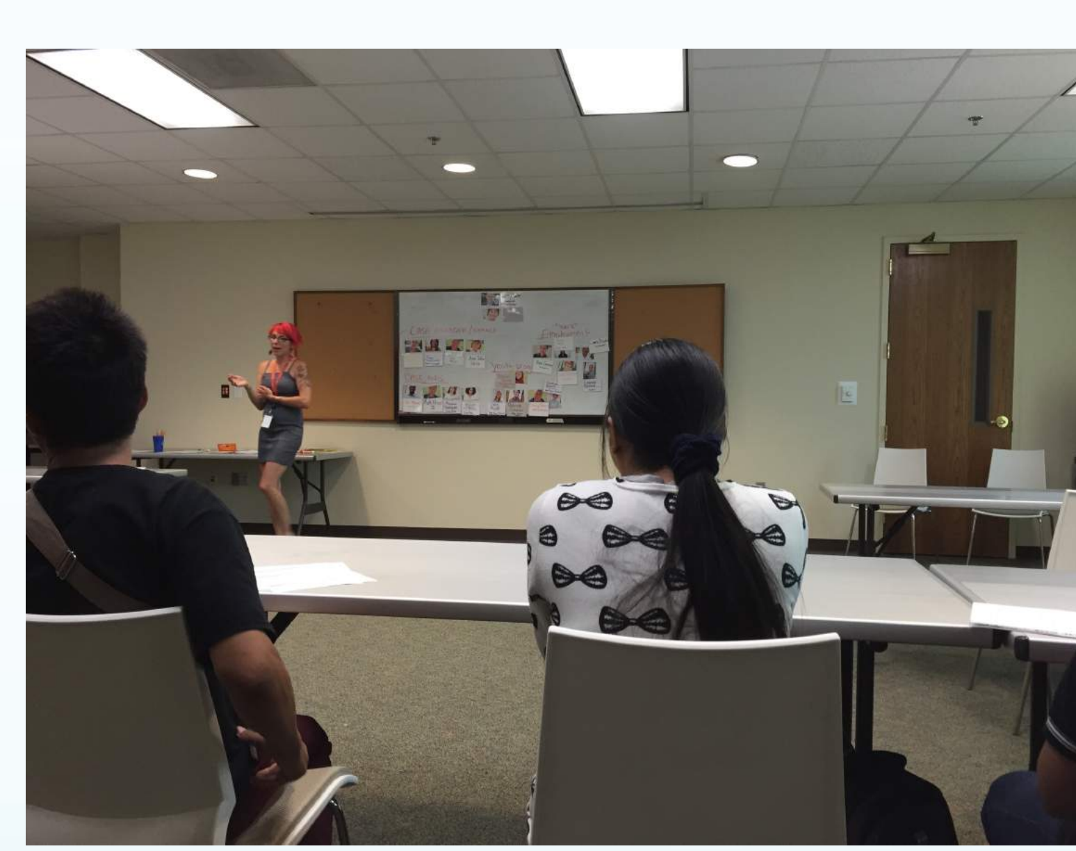
Refugee clients in a cultural orientation class Our Clients

Our refugee clients were from all over the world, including Syria, Congo, Somalia, Burma, Bhutan, and Ukraine We dealt with cases that were either sponsored or free cases, and the cases could be single or family cases.