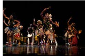
Muntu Dance Theatre

Muntu, coming to GSU Center for one performance only, will feature dynamic works from its vast repertoire, highlighting traditional dance and music rooted in West Africa and performed with its signature "flash and energy."