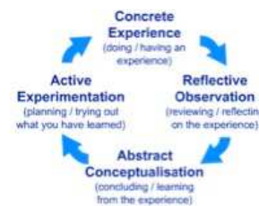
Figure 1. The Kolb Learning Cycle. Image developed by Clara Davies and Tony Lowe, http://www.ldu.leeds.ac.uk/ldu/sddu_multimedia/kolb/static_version.php .

Winiski goes on to note that the Learning Cycle of "exploration, reflection, conceptualization, and application" (see Kolb 1984) offers a good framework for designing courses that promote these interactions (2012). 3