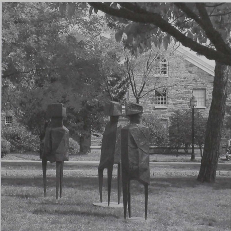
Additional work from the Outdoor Sculpture Collection at Ursinus College (The Watchers, 1960, artist: Lynn Chadwick).