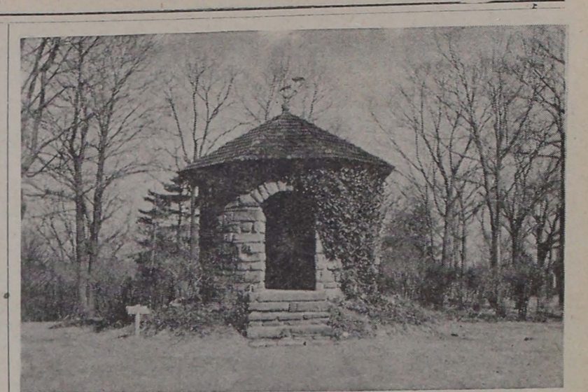
STILL STANDING—Thanks to active student support, the walls of the "popular" Glenwood Memorial stand firm against threat of possible collapse. - (Photo by Beckley).