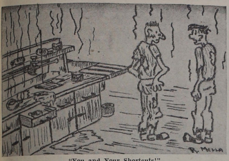
"You and Your Shortcuts!"