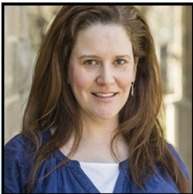
Community Relations Chair