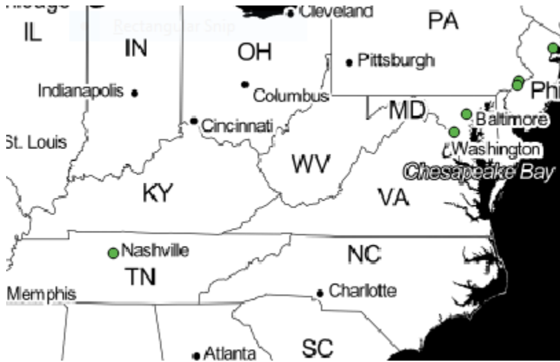
Figure 2- Jessie Fauset's biographical map, mapped on an online Stamen Toner map