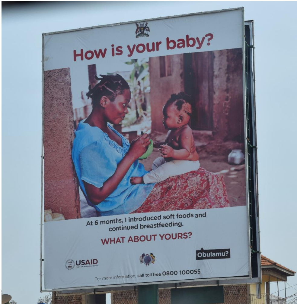
Figure 2 - Billboard in Mukono, Uganda

The discipline of history has largely ignored Uganda because its story has not been deemed sensational enough to capture the attention of a predominantly Western audience. By contrast, other fields such as economics and journalism have grown increasingly attracted to the former colony due to the plethora of topics available for study. This realm facilitates the interaction of diverse methodologies with undiscovered and underutilized themes. For instance, Dutch economic historian Felix Meier zu Selhausen examined Protestant parish records to determine that female education at mission schools was not enough to guarantee social autonomy; brides delayed marriages and minimized age differences between themselves and