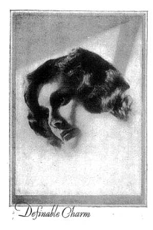
Figure 5. Portrait of a woman above an advertisement for Lemon Juice Rinse hair product. The Delineator (Dec. 1928), p. 66.

advertisements to sell products and consumerist ideologies. In her analysis of Wharton's novel, The Mother's Recompense , in its serialization in the Pictorial Review , Thornton reveals how "the ad and illustration confirm the magazine's consumer agenda: tie the fictional text to the advertiser's sales interests; and provide both instructions on what is a desireable woman and points of identification and fantasy for becoming that woman" (Thornton 42). Although Halo's character calls out this commodification of literature like beauty products in Wharton's text, The Delineator 's advertising strategies revise her character as an advertising tool and commodity when closely paring illustrations with advertisements.