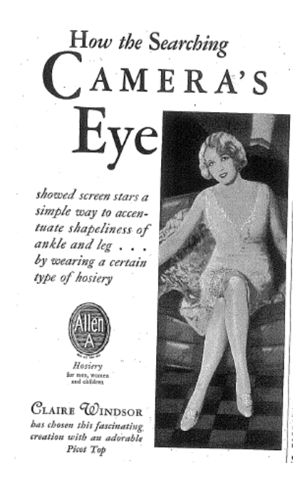
Figure 2. Advertisement displaying a famous woman named "Claire Windsor" to promote a hosiery brand. The Delineator (Dec. 1928), p. 72.

Figure 1. Advertisement for a Sal Hepatica face serum for improving complexion. The Delineator (March 1929), p. 84.