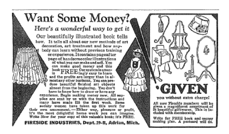
Figure 4. Advertisement for a free booklet on house decoration as a job for women to make extra money. The Delineator (Feb. 1929), p. 104.

"freedom to shop" to promote their individuality, ironically through mass-produced products (Davis 9). Brand diversification and competition was "thought [to offer] a free choice" for women; however, Berger argues that the publicity is never really about just the product or "a celebration of a pleasure-in-itself," but about selling an ideology (131-32). Magazines also promoted stories in which female characters would make small amounts of income, showing how editors conceived the messages of their fiction in contrast to the consumerism necessary for them to profit from ads (Garvey 139-42). Meanwhile, Wharton exposes this false premise of agency through the characterization of Halo, who lacks the freedom she desires like other girls her age who have their own cars, apartments, and so on, which in turn allow them to avoid marriage. Halo considered professions similar to advertised ones in The Delineator like writing and painting to earn an income, but succumbs to the belief that "her real gift...was for appreciating the gift of others" (Hudson 104). The new jobs advertised for women in the 1920s were not created for women like Halo to have their independence, but as small disposable incomes designed for housewives and mothers to spend to become better at their traditional social roles.