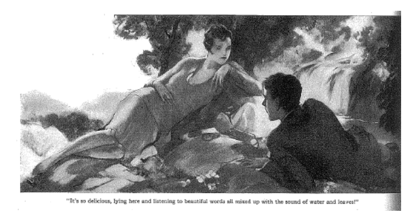
Figure 6. Illustration of Halo and Vance on the mountaintop. The Delineator (Dec. 1928), p. 16. Illustration by Henry Sutter.