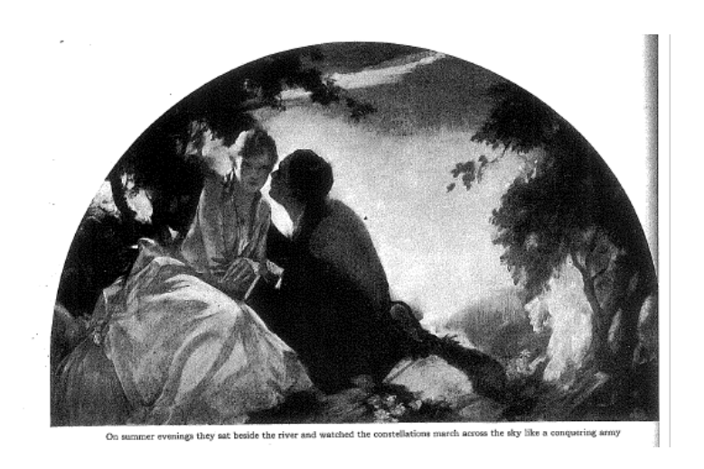
Figure 7. First illustration of Halo and Vance. The Delineator (Sept. 1928), p. 12. By Henry Sutter.