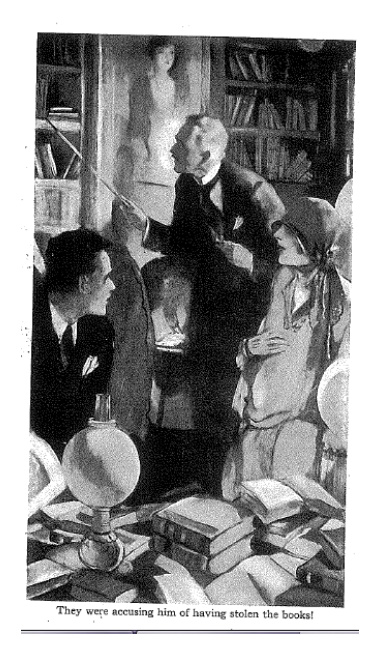
Figure 11. Illustration of Vance (on the left), Halo, and Mr. Lorburn in the Willows library. The Delineator (Jan. 1929), p. 16.

Meanwhile, The Delineator also alters Halo's character as an intellectual, upper-middle class literary critic to promote more traditional, middle-class roles for women seen in the advertisements and illustrations of women. Although Vance initially feels insecure around Halo after she forgot to arrive at dawn to take him to Thundertop, The Delineator reduces his timidity by cutting his worrying that she had "forgotten him because he was too young and insignificant to be remembered" as well as his reference to the fact that she was a few years older than him ( Hudson 92-93; Nov. 1928). The next issue also removes several of Wharton's lines depicting Halo as more educated and cultured than Vance such as "the simplest things she said presupposed a familiarity with something or other that he was ignorant of" ( Hudson 97; Dec. 1928). Beyond these subtle hints at Halo's maturity and intelligence, The Delineator goes further to remove her critique of Vance's poem, stripping her of her role as a literary critic in the novel (Dec. 1928: 17). After she critiques his diction and rhyming, Vance ruminates on how "her verbal criticism...brought him down like a shot bird. He hardly understood what she meant, did