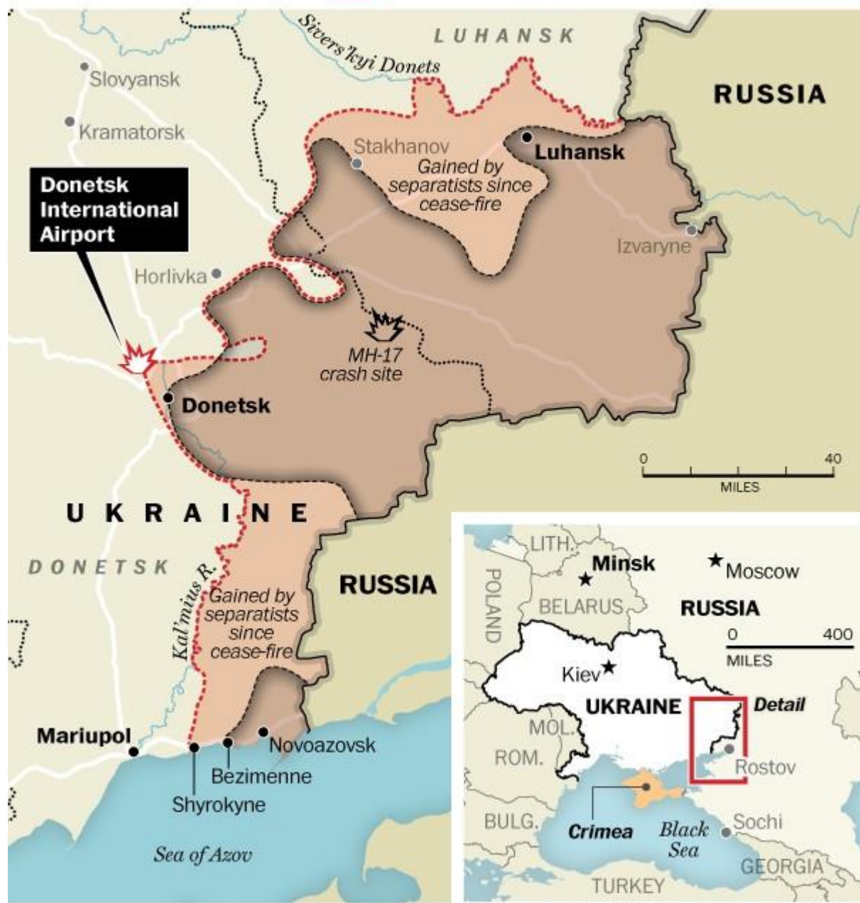
Map 3. "Rebels Make Gains during Cease-fire." Washington Post .

Separatist-controlled area: Sept. 30 Sept. 5, Start of ceasefire