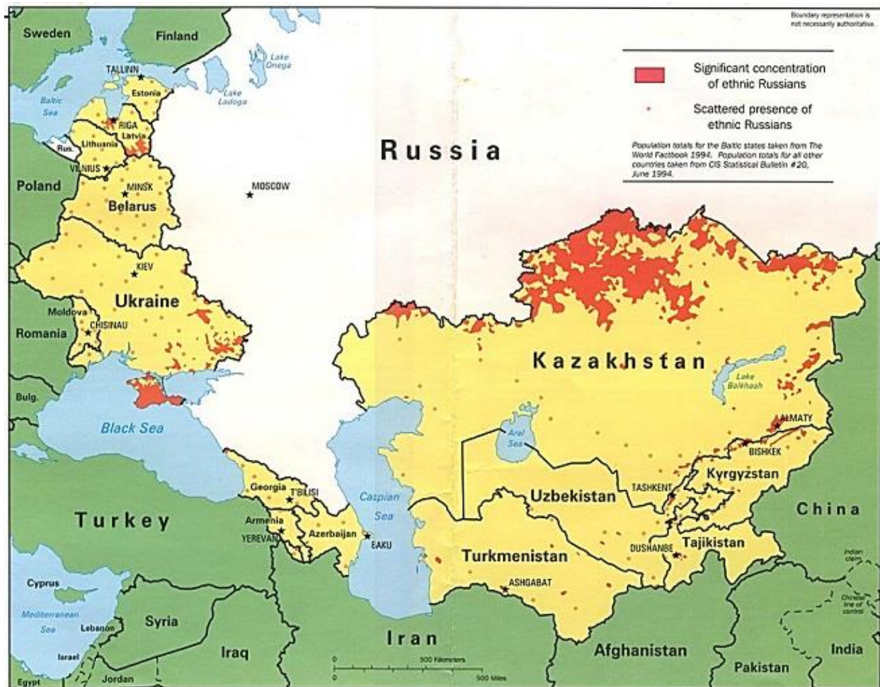
Map 2. “Ethnic Russians in the Newly Independent States.” University of Texas Library.

In much the same way that the events of Kosovo had been portrayed from a single perspective in the Russian media, the conflict of the Ukraine crisis followed a similar pattern.